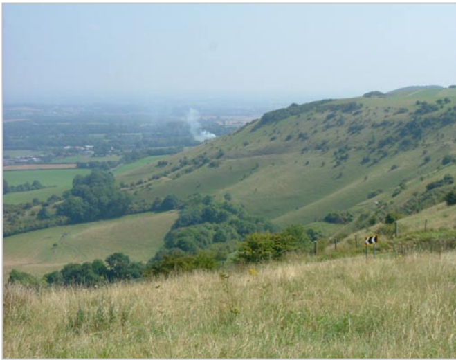
Elevated landform provides panoramic views over the scarp footslopes and beyond.