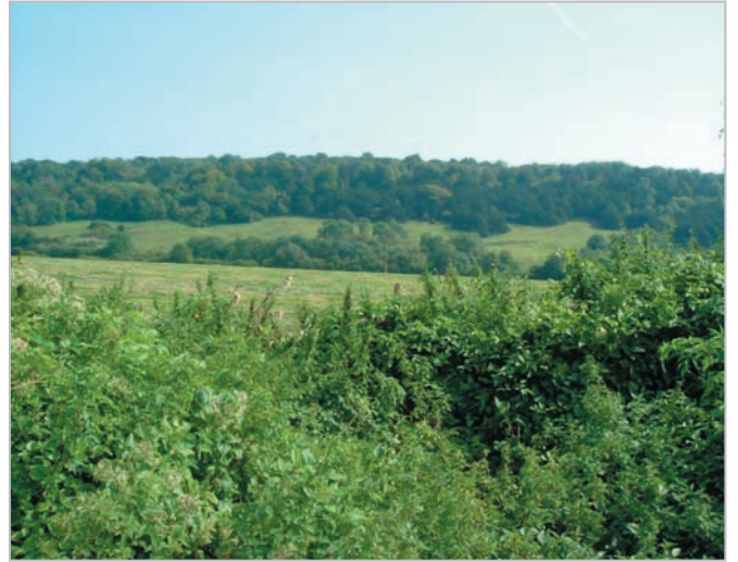
Woodland and chalk grasslands associated with the higher and steeper elevations.