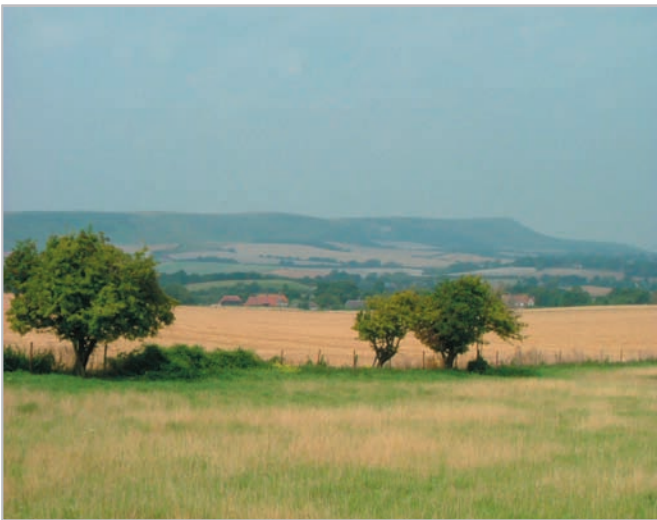
The scarp is remarkably consistent in height and slope profile.