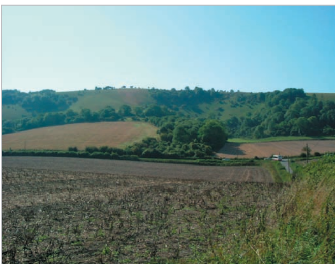
Ploughed fields at the base of the scarp contrast with the precipitous wooded scarp.