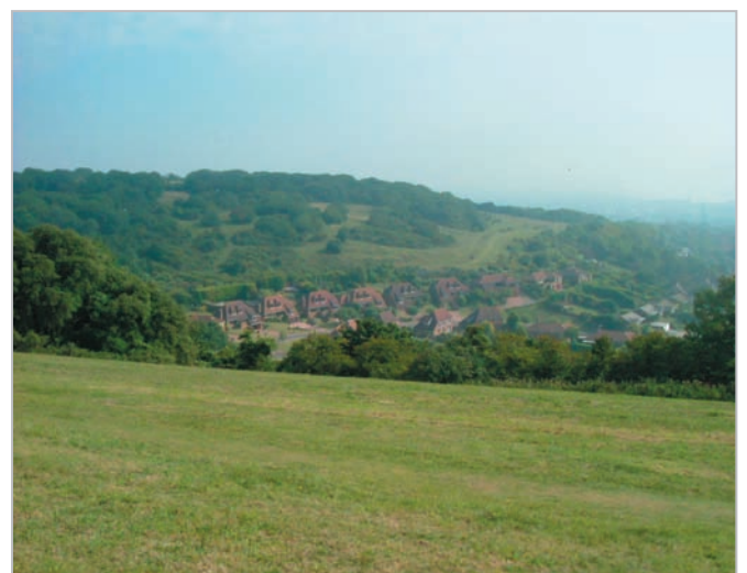
The built edge of Eastbourne creeps up the lower elevations of the scarp.