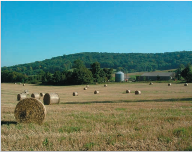
Well wooded, with some of the woodland comprising ornamental planting associated with parkland landscapes.