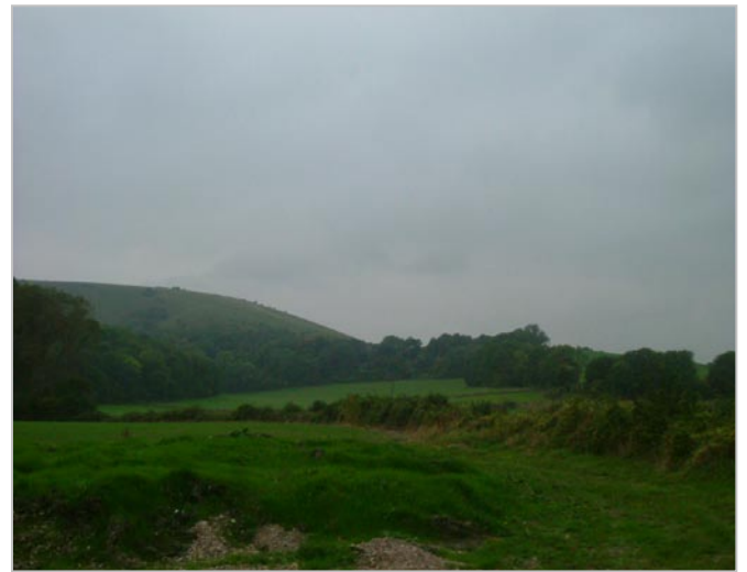
A north facing chalk escarpments exhibiting a distinctive slope profile.