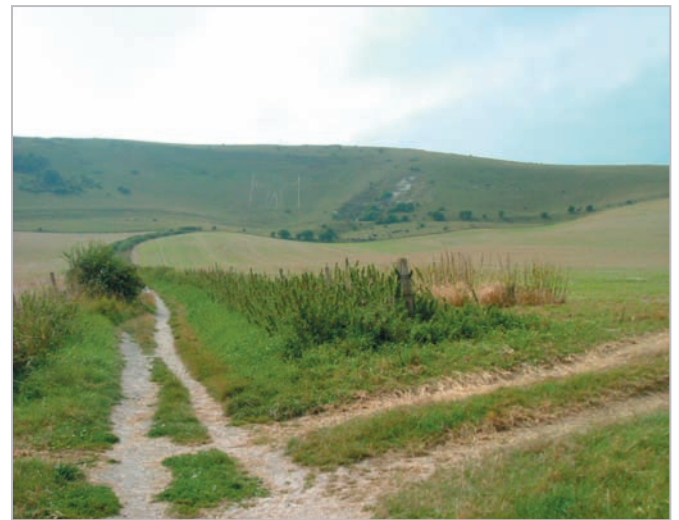
Tracks cut through the escarpment and link the lower land to the chalk uplands.