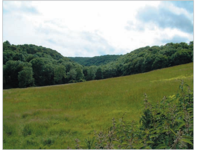
Woodland of key high biodiversity value.