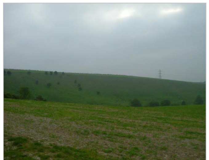
A very gentle scarp with pasture being the predominant landcover.