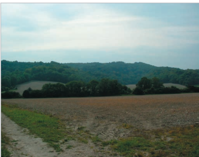
The scarp landform is a visually prominent feature from the adjacent, lower lying land.