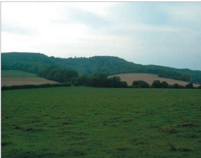
A well wooded scarp, with much of the woodland pre-dating 1800.