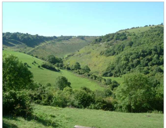
Devil's Dyke is a complex coombe, creating a locally sinuous scarp.