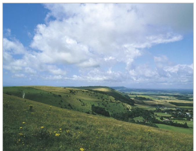
Chalk grassland on the steep scarp slope.