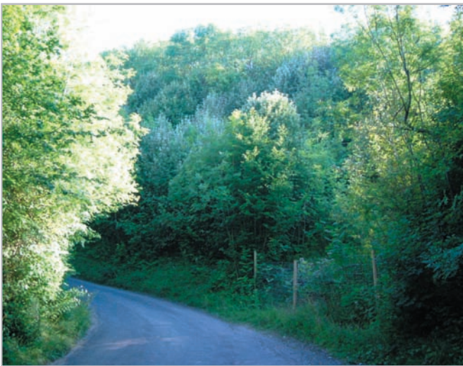
Narrow lanes with an enclosed character cut through the wooded scarp.