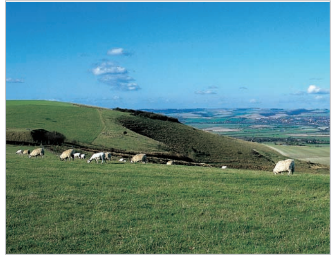
Sheep grazing is characteristic of the steep scarp slopes.