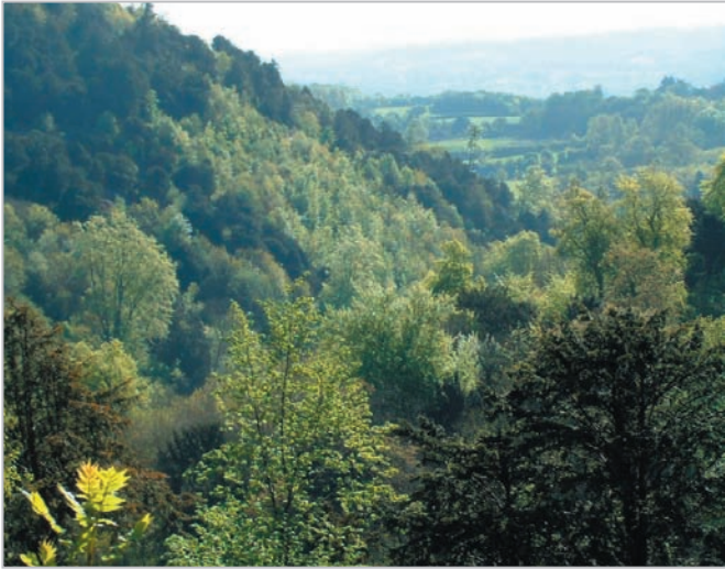
A panoramic view across the Ashford Hangers.