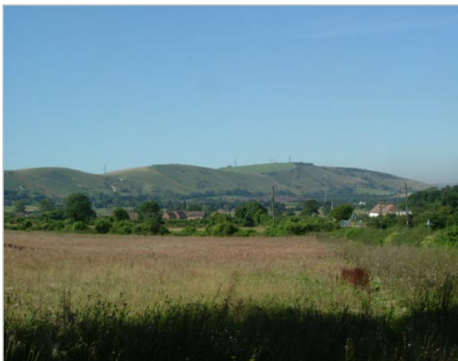
The scarp is deeply indented by coombes and has an undulating skyline.