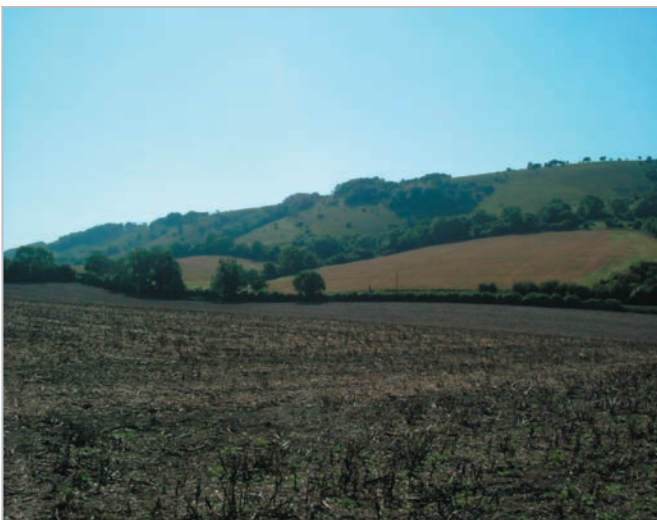
At the foot of the scarp where the slopes are less steep the land is ploughed.