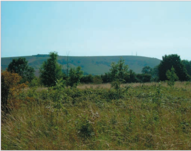
Pylons on the summit of the scarp are visible against the skyline.