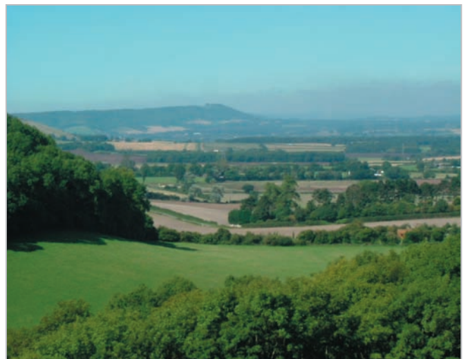
The elevated landform provides panoramic views over the scarp footslopes.