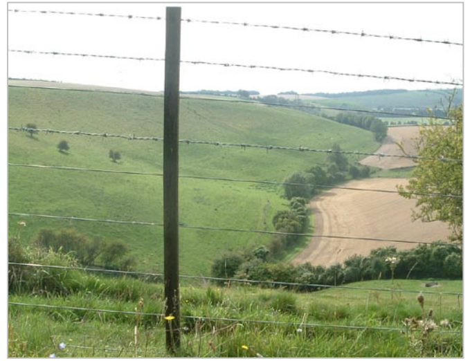
The scarp supports little woodland, revealing its open, smoothly eroded form with extensive areas of chalk grassland habitats.