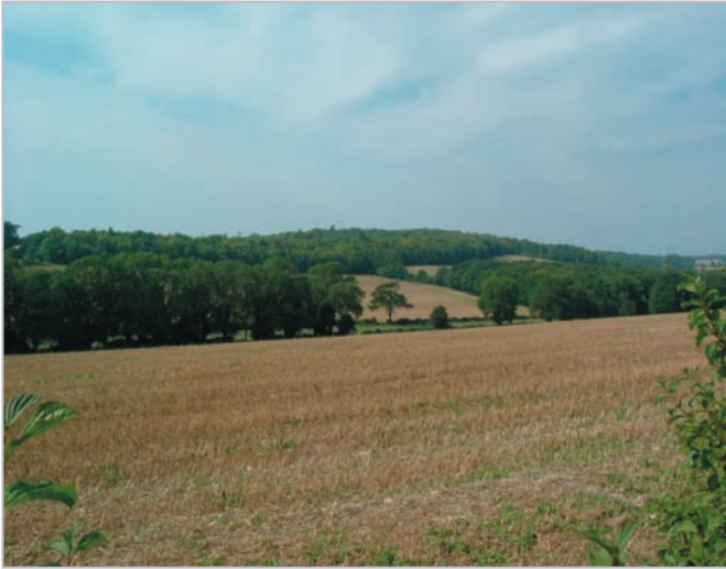
Arable fields are found on the more shallow slopes of the scarp.