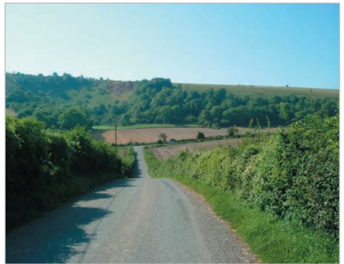
Rural road through Steyning continues up the scarp slope to the open downs.