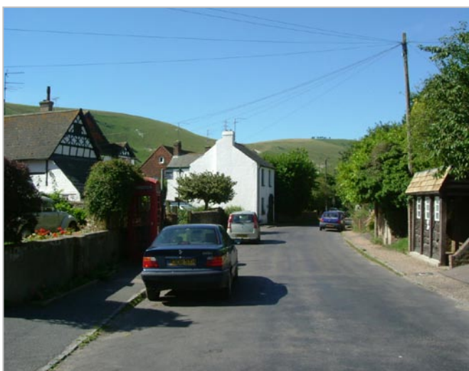
Springline villages located at the base of the scarp e.g. Poynings.