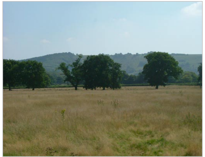
A variety of woodland types occur, including oak, ash and beech woodland.