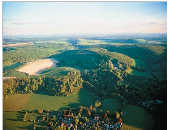
The wooded scarp provides a sense of enclosure to Buriton in the scarp footslopes.