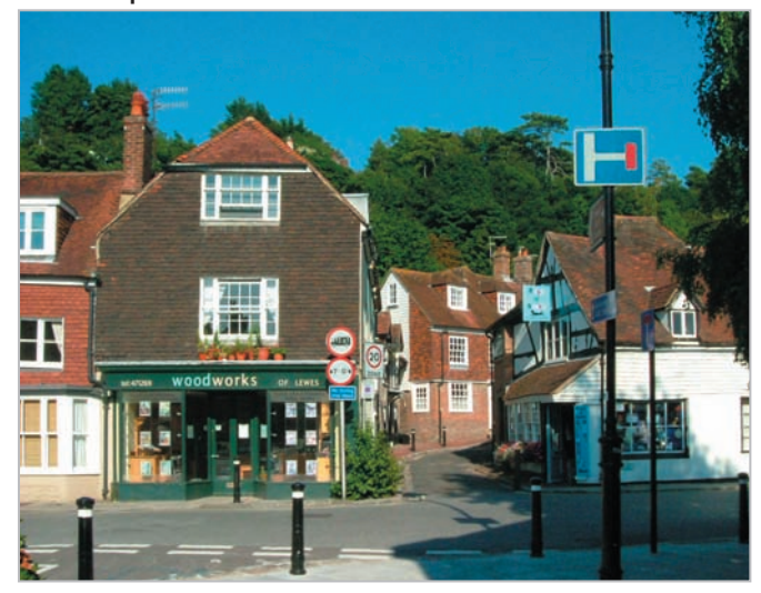
The historic village of Cliffe developed around an ancient ford.