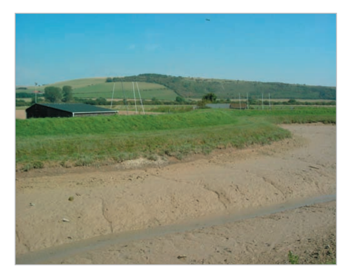
The floodplain includes a network of tidal channels.