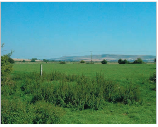
The absence of woodland and generally low incidence of trees, results in a large scale, open landscape.