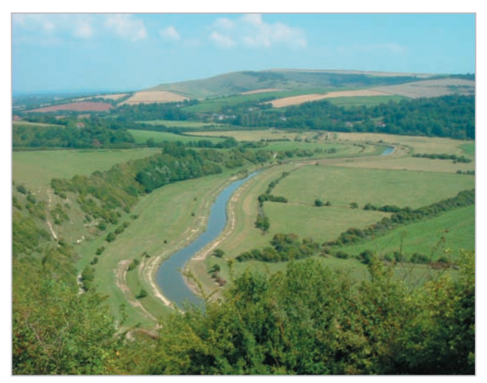
Footpaths along the river banks provide opportunities for recreational use.