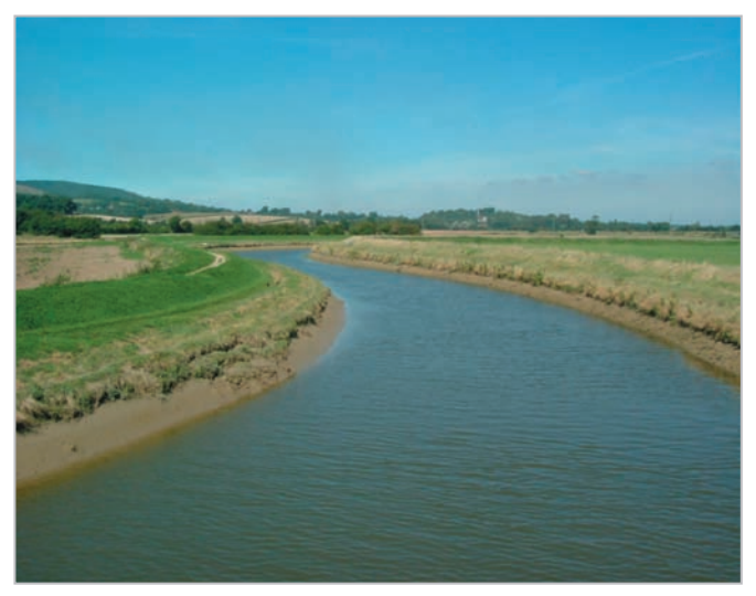
The meandering course of the River Adur.