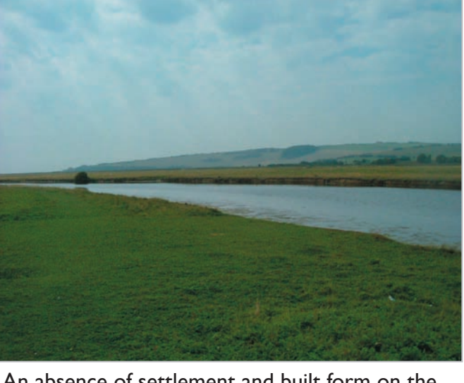
An absence of settlement and built form on the floodplain.