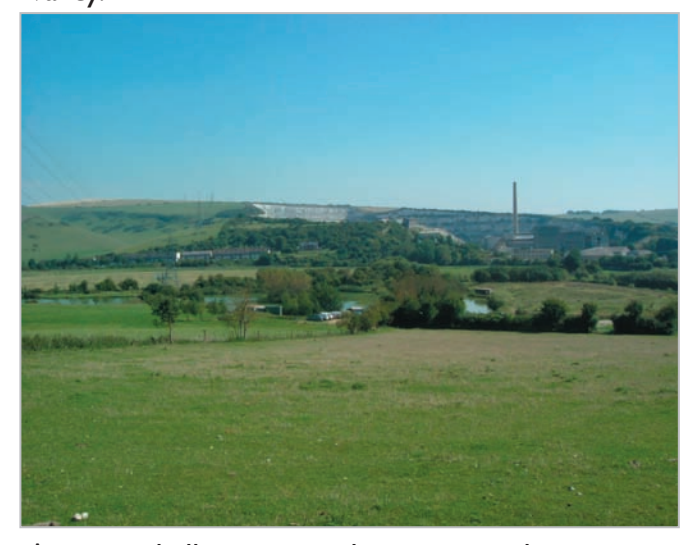
A major chalk quarry and cement works at Shoreham is a highly visible landscape feature.