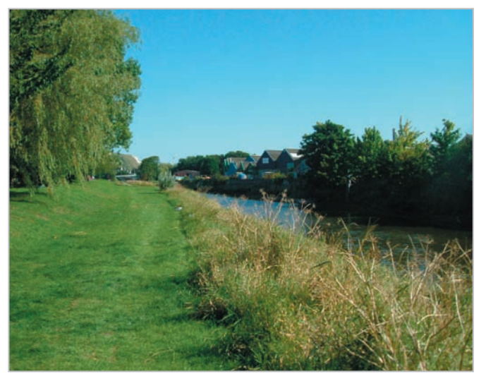
Artificially straightened sections of the river's course are associated with its industrial history.