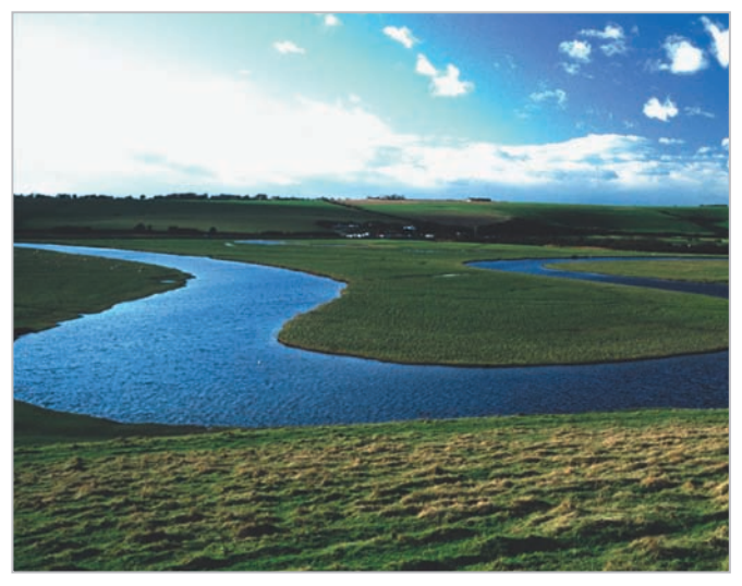
A landscape of apparently large and expansive scale as a result of the flat form and consistent landuse.