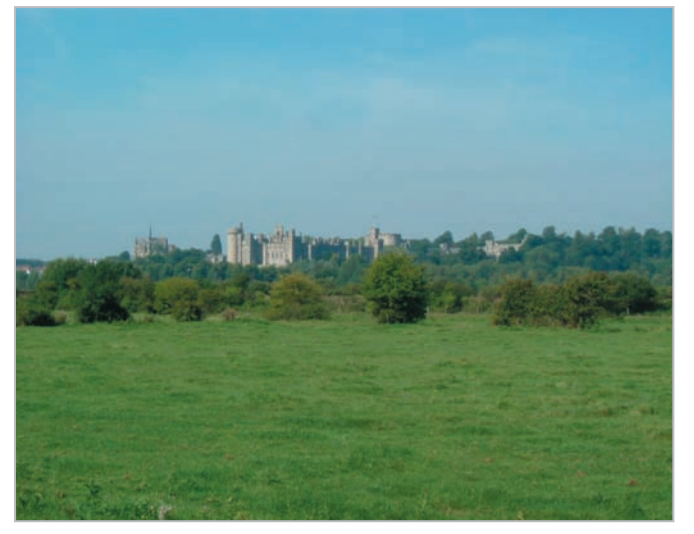
Impressive views to Arun Castle at the mouth of the river.