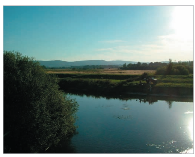
Some sections of the river are artificially straightened.