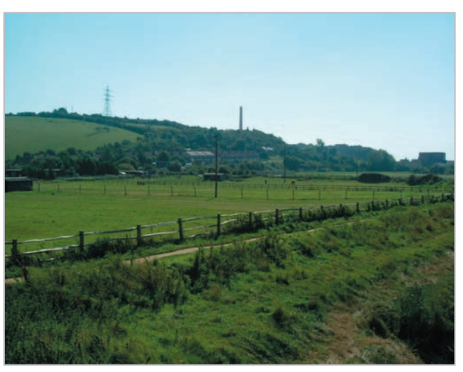
In places, paddocks have subdivided the open floodplain.