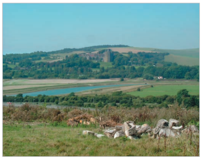
Views to the landmark building of Lancing College forms a distinctive entrance to the Adur Valley.