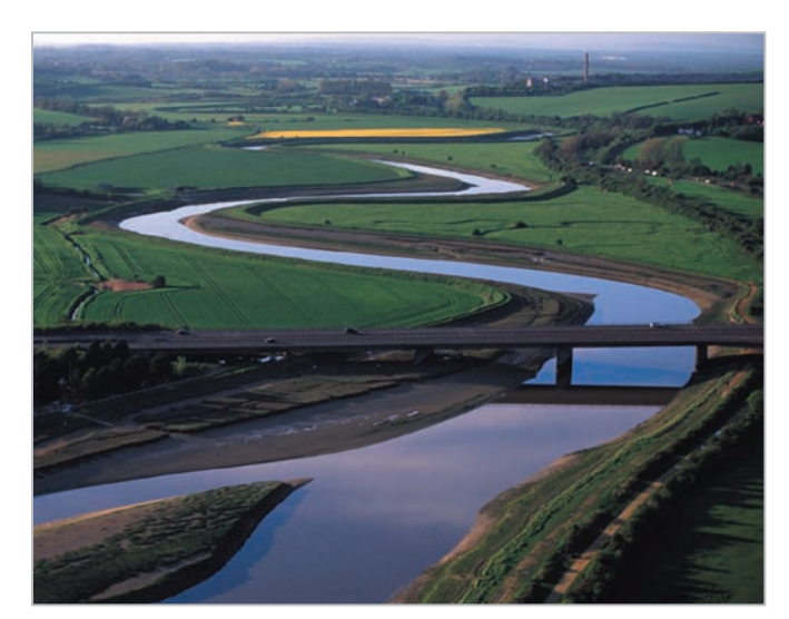
The A283 and A27 both cross the river and detract from the sense of tranquility.