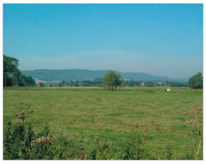
The flat landscape is enclosed by the surrounding valley sides and scarp.