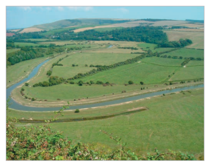
The river meanders across the floodplain in broad loops.