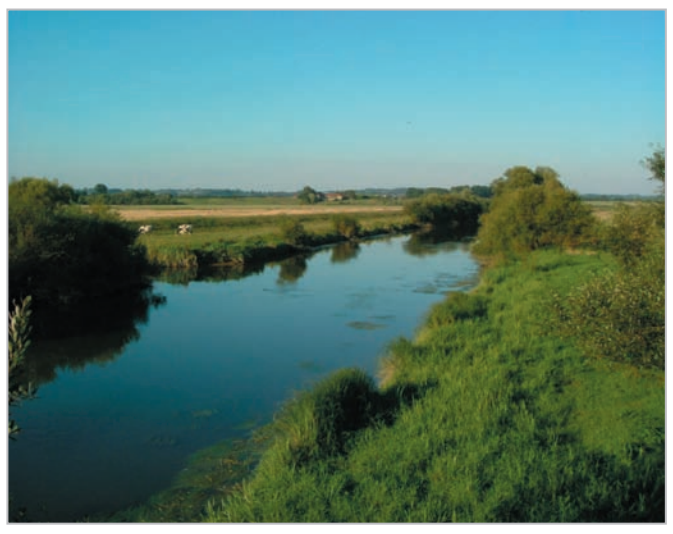
In places, a natural, tranquil, pastoral river floodplain landscape.