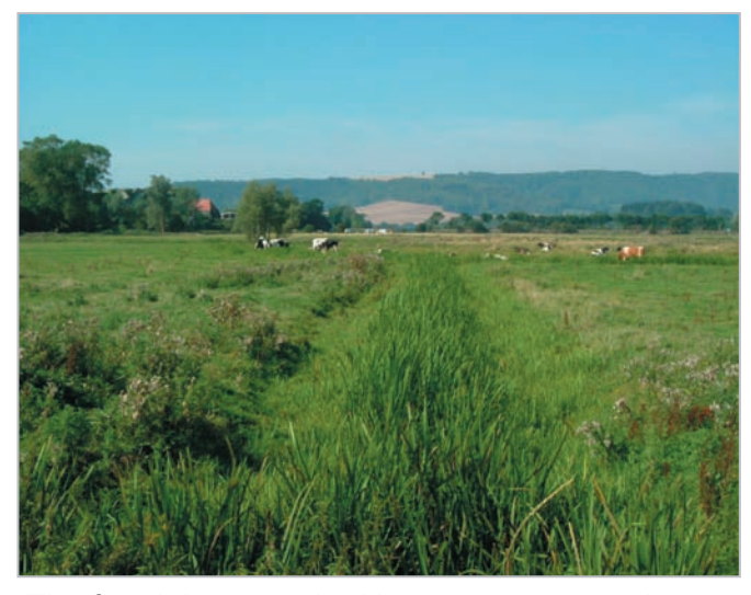
The floodplain is etched by a geometric grid of narrow channels or 'wet fields' which divide pastures.