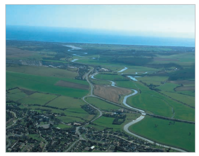
The wide valley of the Ouse cuts through the chalk.