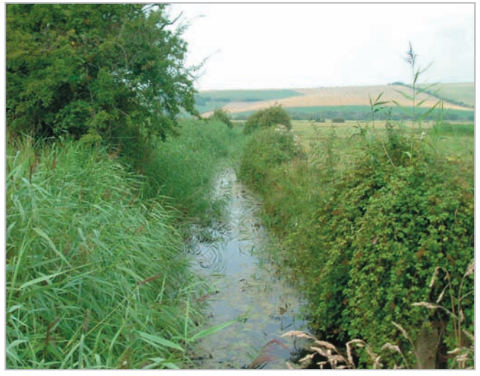
The floodplain is etched by artificial geometric drainage ditches.