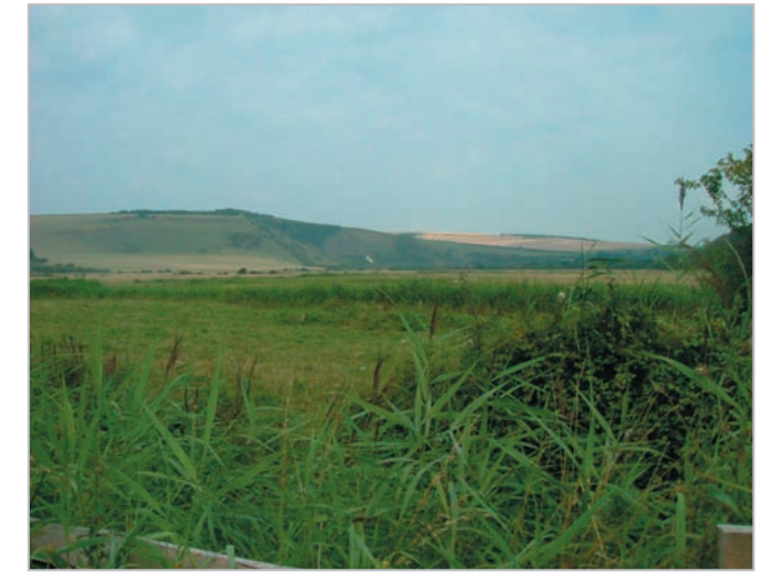
Away from transport corridors the floodplain retains a tranquil, unspoilt character.