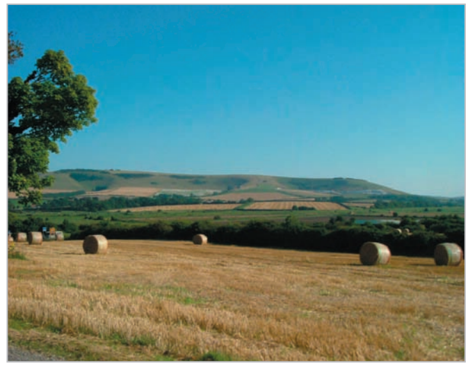
Although the landscape has a generally pastoral character, there are blocks of arable cultivation.