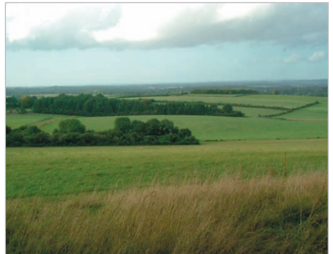
Long, open views from higher elevations.