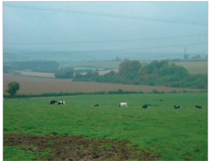
A network of arable and pastoral fields.