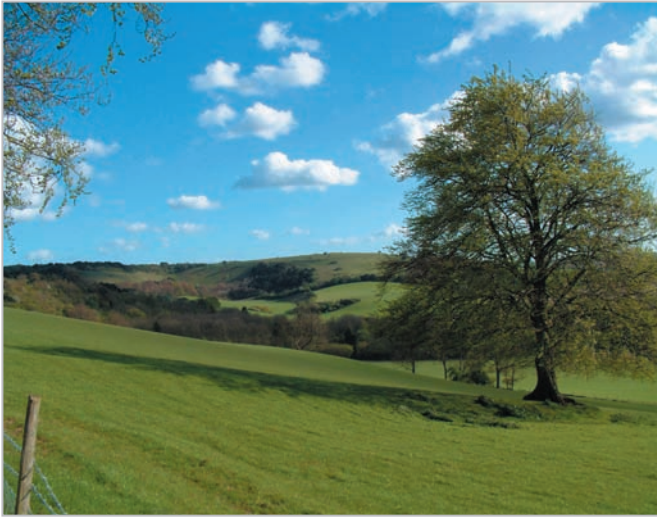
Large scale, rolling landform dissected by dry valleys.