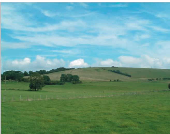
Blocks of unimproved grassland remain on steeper slopes.