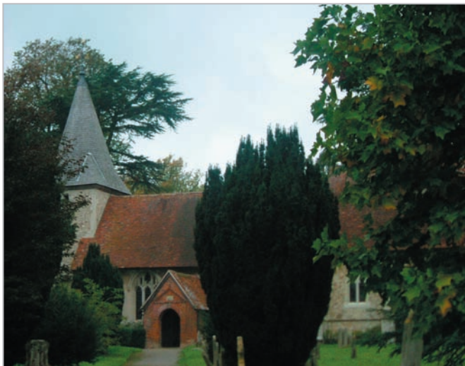
A distinctive church spire at Newton Valence.