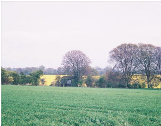
Village landscape, Bramdean.