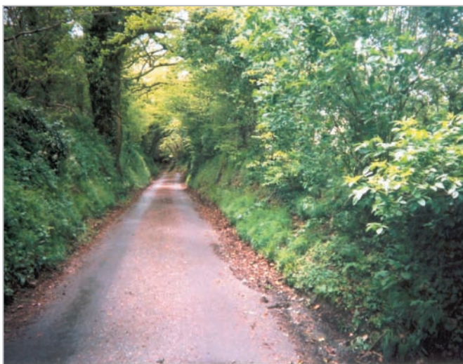
A network of rural lanes connects the characteristic scattered farmsteads and hamlets.