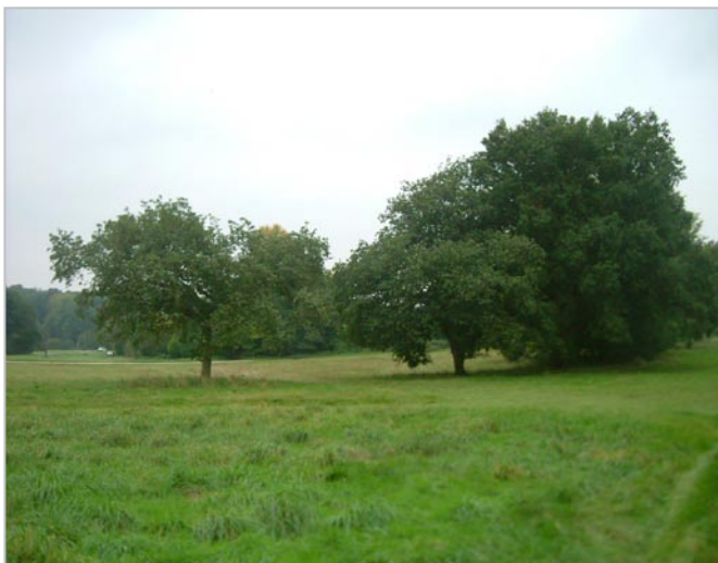
Woodland and unimproved grassland.