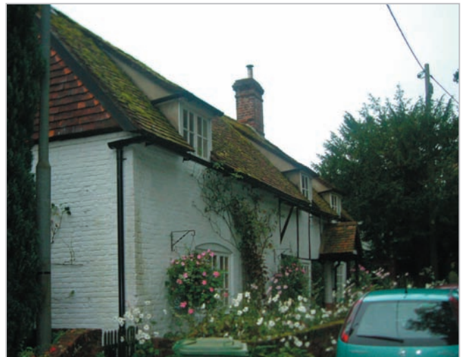
Housing at Farrington showing traditional building materials of brick and tiles.