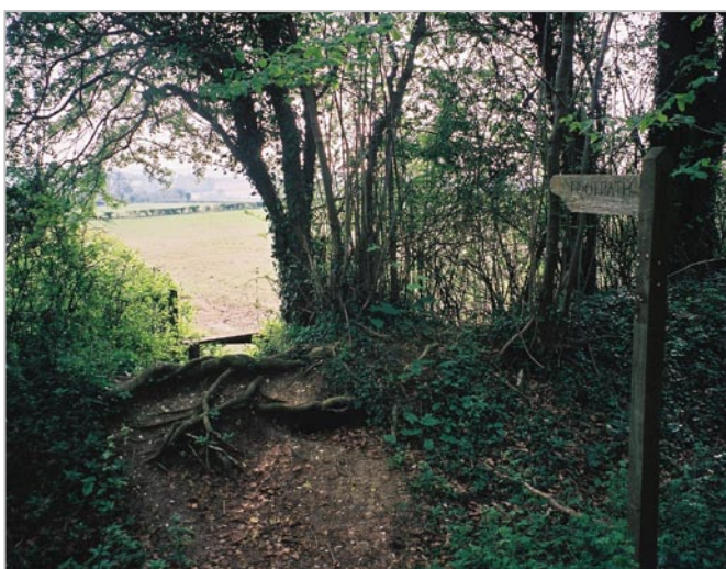
The area contains a well established network of public rights of way.