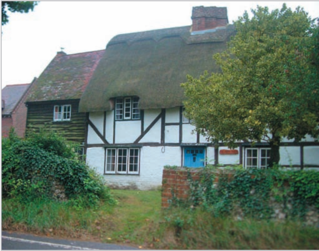
A low density of dispersed settlement with a scattering of nucleated settlements demonstrating traditional building techniques.