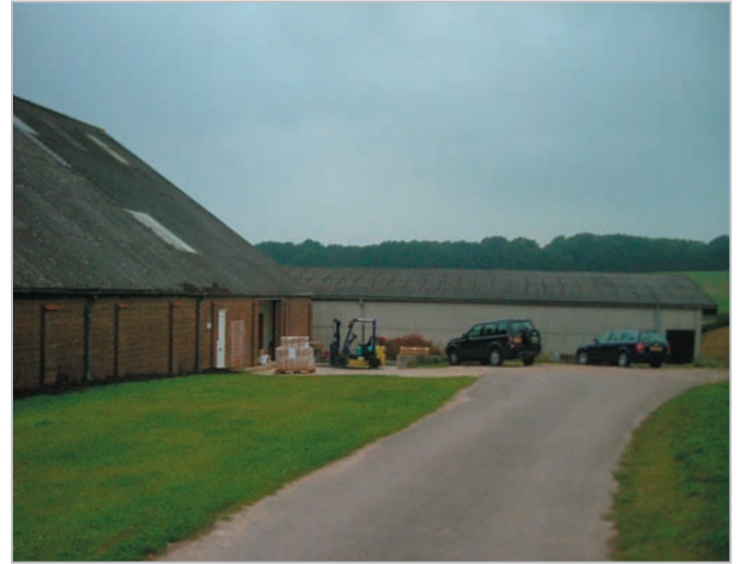
Modern farm buildings are prominent.