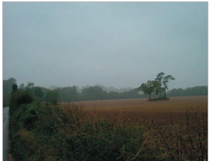
The well developed hedgerow network provides unity and bio-diversity value.