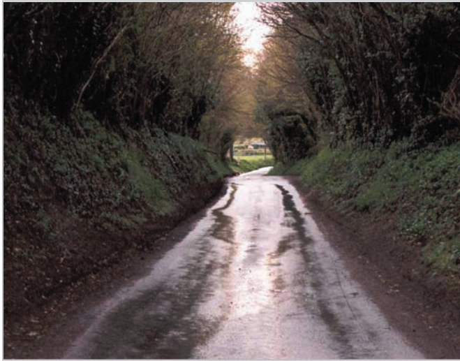
Ancient woodland borders a sunken lane at Inadown.