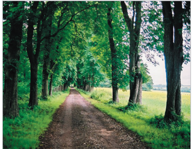
Lime Avenue, Longwood Estate.