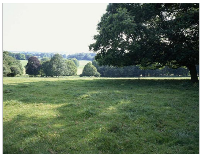
Hinton Ampner parkland landscape, Bramdean.