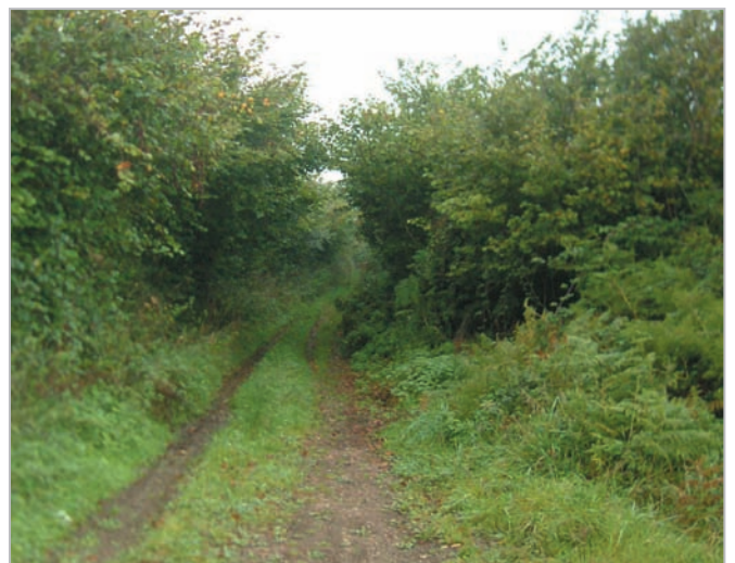
The surface clay capping in this character area results in a high proportion of tree and woodland cover which contributes to the enclosed character.