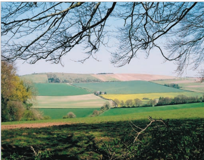
A prominent chalk ridgeline rises at Old Winchester Hill to form a prominent landmark.