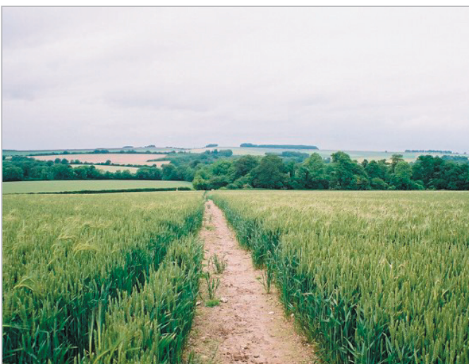
A mosaic of arable land and woodland.