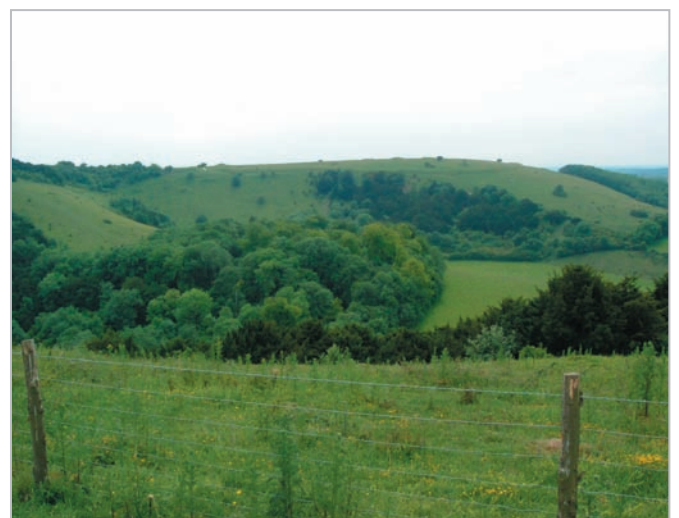
The secondary escarpment supports chalk grassland, assarts and hanging woodland.