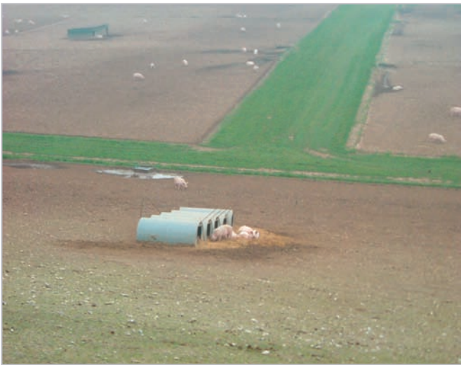
Pig farming is characteristic of some areas.