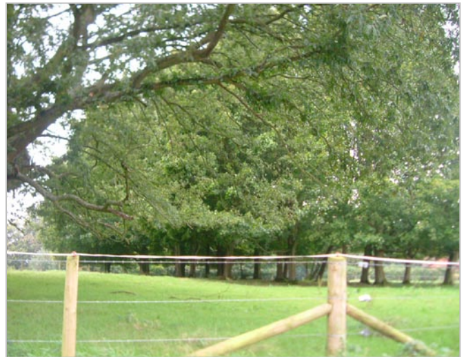
A number of minor parklands and designed landscapes.