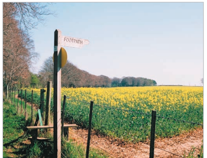
The Downs contain a well established network of public rights of way.