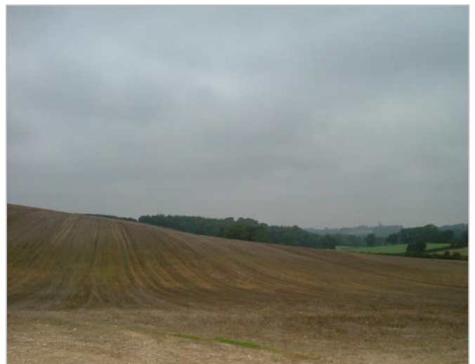
An actively managed arable landscape.