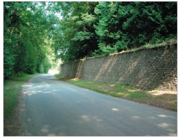
Features such as stone walls around estate parkland create an important visual focus.