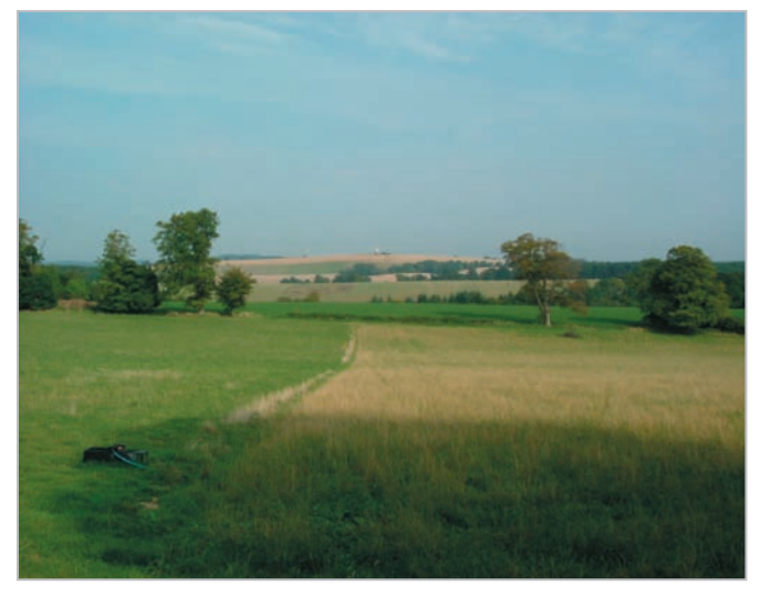
Areas of open pasture and arable land contrast with the more enclosed wooded areas.