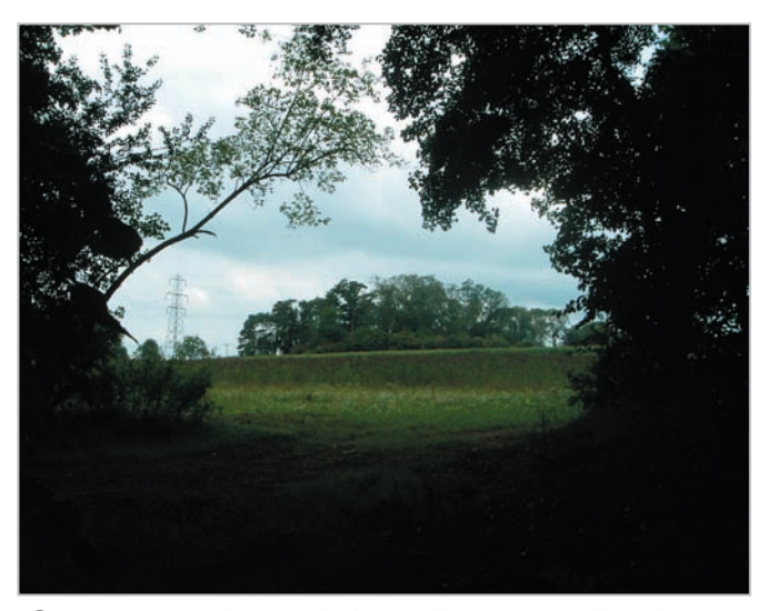
Open views glimpsed through the woodland.