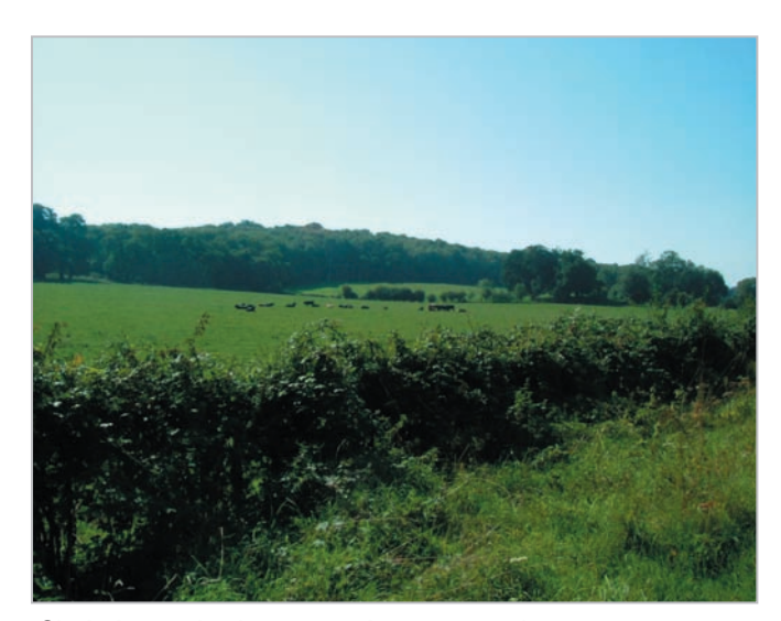
Slightly acidic heavy soils support large expanses of woodland.