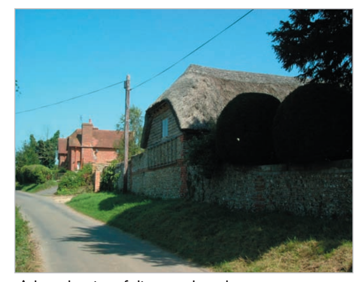
A low density of dispersed settlement, characterised by traditional building materials of brick, flint and hatch.