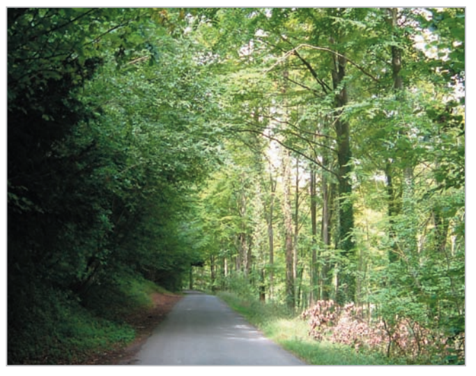
Narrow lanes cut through dense woodland blocks.