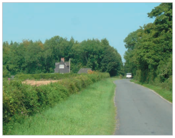
Low density, dispersed settlement characterised by scattered farmsteads.