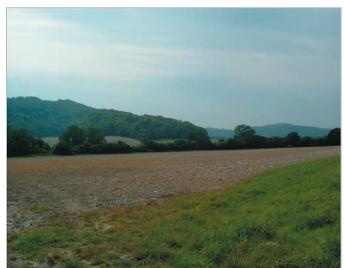
A deeply rural landscape with large areas devoid of roads and settlement.