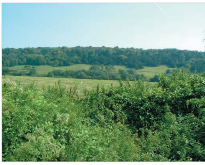
Woodland is interlocked with straight sided, irregular, arable fields linked by hedgerows.