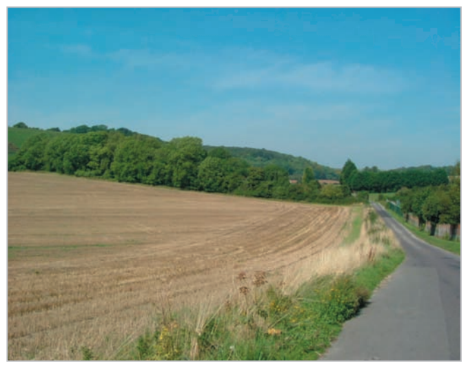
A landscape of contrasts with a more open character.