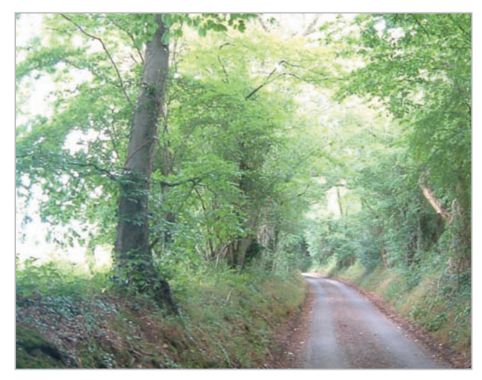
A network of minor hedged lanes, bridleways and public rights of way, provide access through the tranquil landscape.