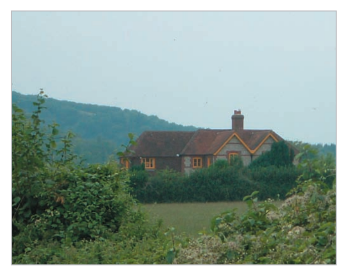
Cowdray Estate houses with distinctive yellow paintwork.