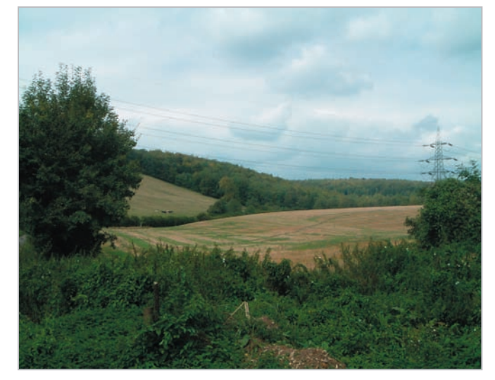
Views to woodland at Queen Elizabeth Park.