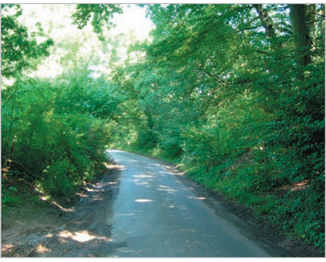
A deeply rural, secluded landscape with a sense of enclosure provided by wooded lanes.