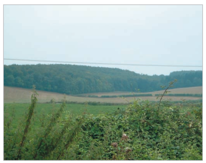
Large scale mosaic of commercial forestry and broadleaved woodland interlocked with straight-sided, irregular open arable fields linked by hedgerows.