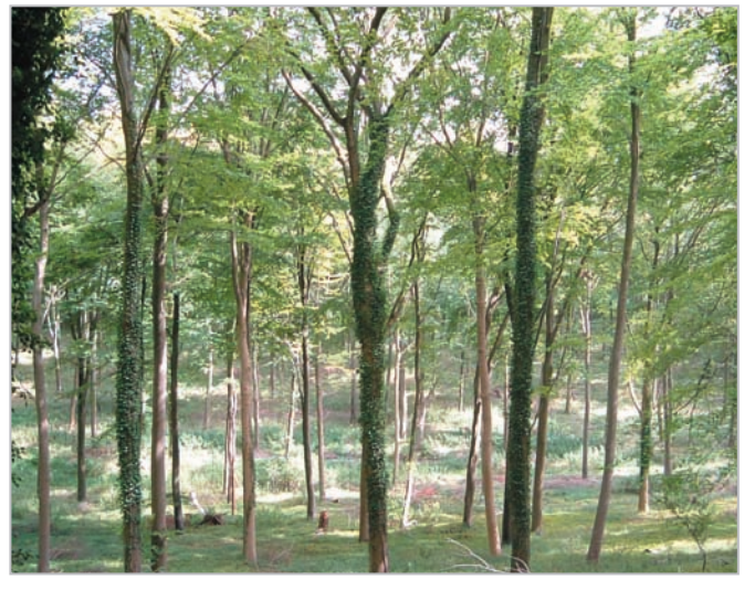
A strong sense of remoteness within the wooded core.