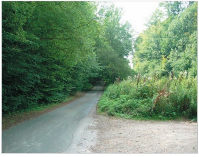
Quiet rural lanes are typical, with other areas inaccessible by road.