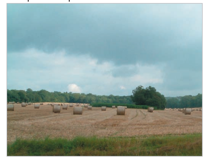
A working agricultural landscape of large, straight sided fields enclosed during the 18th and 19th century.