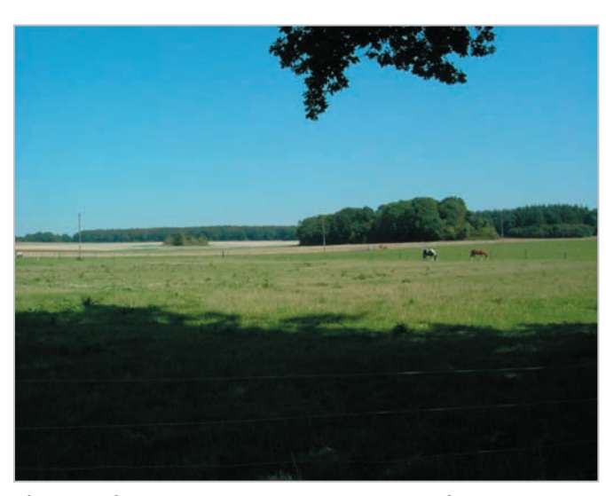
Areas of unimproved grassland used for pasture.