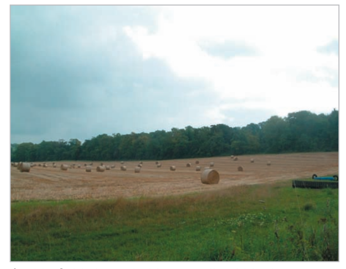
Arable fields bounded by woodland blocks.