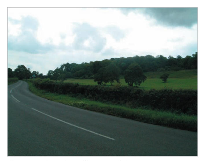
Estate parkland is a feature of the area.