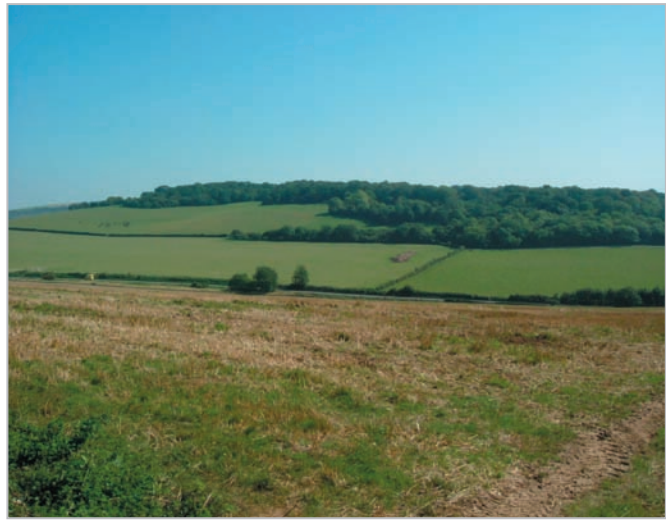
Woodland is interlocked with straight sided, irregular open arable fields linked by hedgerow.