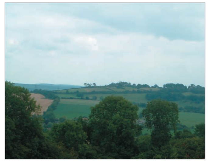
Chalk dipslope exhibiting a strong and distinctive topography of rolling hills and extensive branching valleys and coombes.