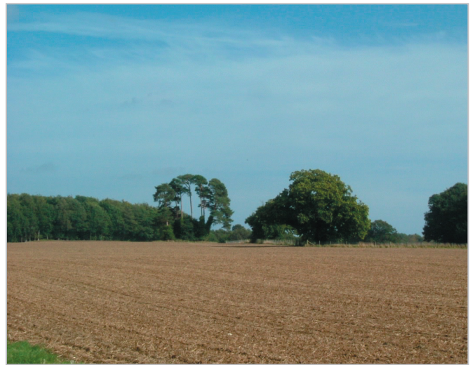
Woodland surrounded by recent (18th and 19th century) enclosure which often forms straight edges and sharp corners.