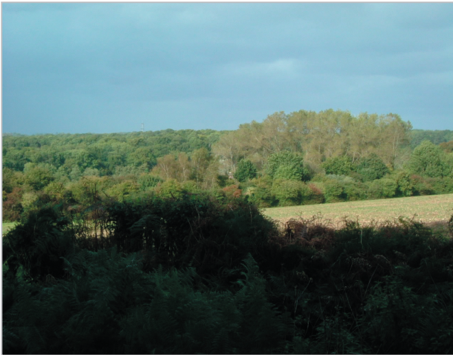
Large woodland blocks, provide important ecological habitats.