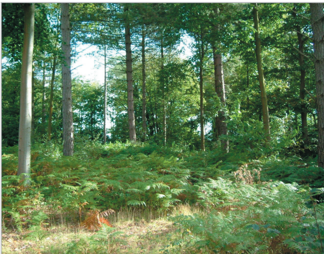
Heathland landscape on sandy soil.