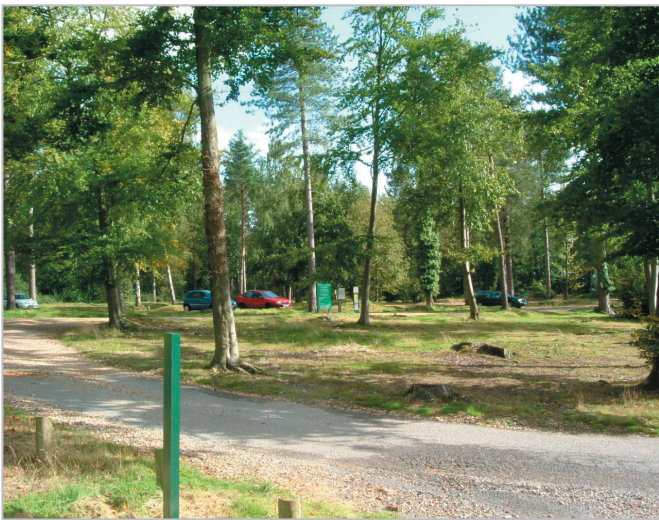
Large areas of woodland are owned by the Forestry Commission and provides good opportunities for recreation.