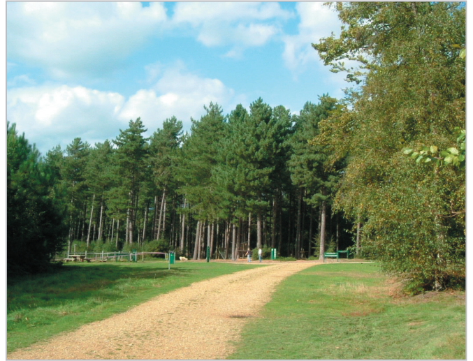
Well drained sandy soils, support coniferous woodland and heath.