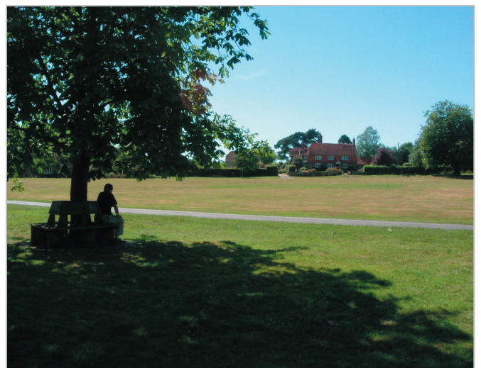
Lingshall Village green.