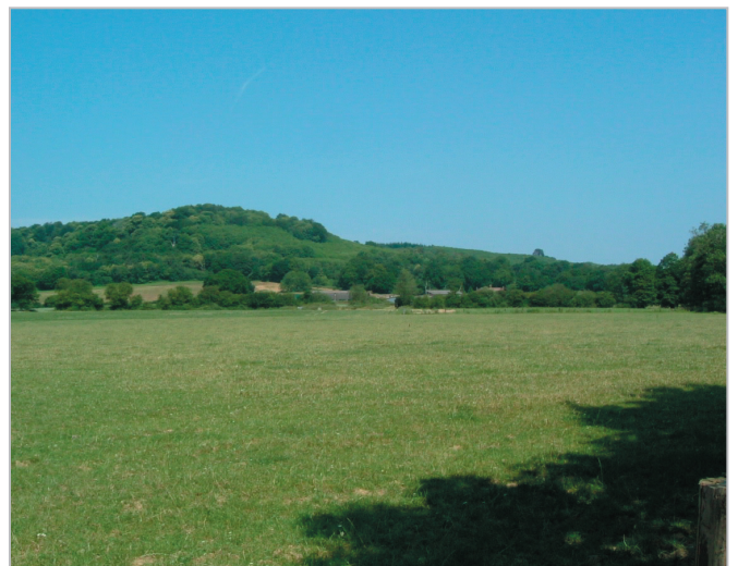
A deeply rural, tranquil landscape with an essentially medieval pattern.