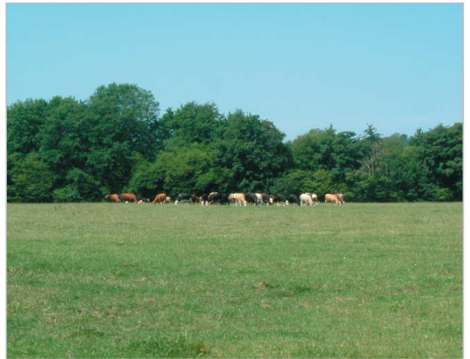
Linear strips of remnant woodland (shaws) are distinctive features.