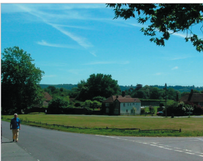
Fernhurst village, set around a green.