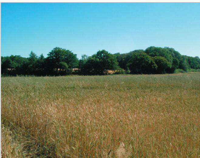
Arable fields with a woodland boundary.