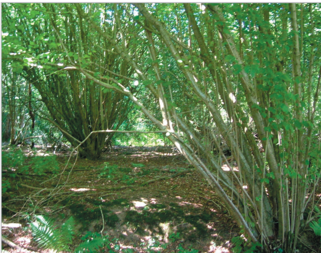
Chestnut and hazel coppice.