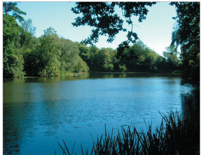
Rich in ponds and streams e.g. pond at Shillinglee.