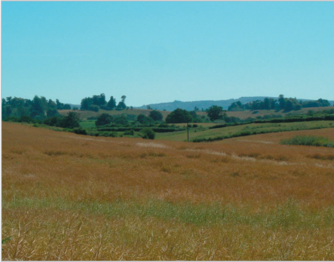
Undulating arable fields and undergrazed fields.