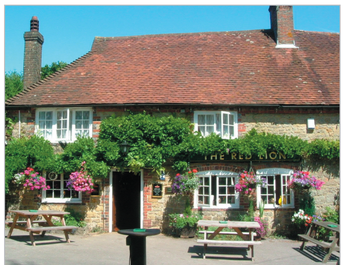
Typical building materials are local sandstones, red brick and clay tiles.