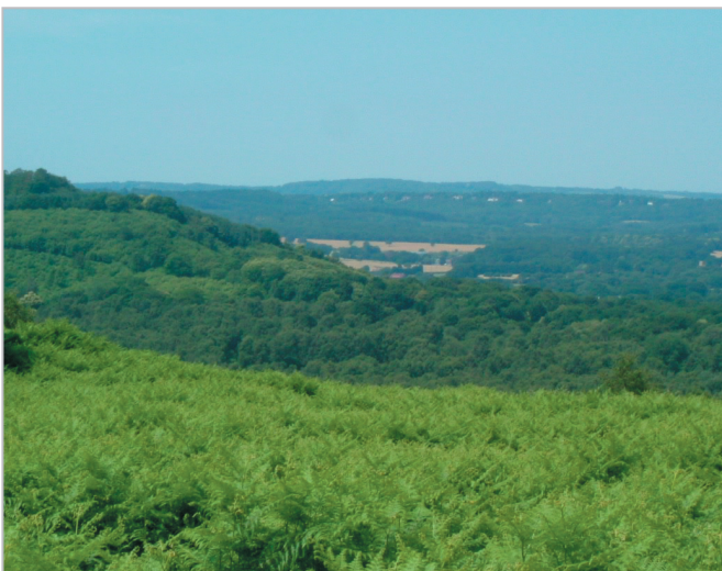
A lowland vale enclosed by Greensand Hills.