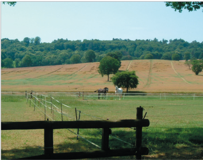
Mature hedgerow oaks are a feature, some marking the line of former hedgerow.