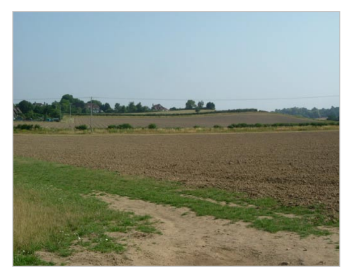
Erosion of sandy soils is a key issue in this area.