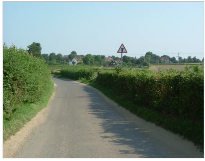
Bracken is a feature of the hedgerows, reflecting the sandy character of the soils.