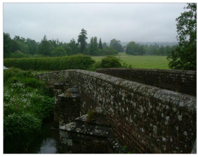
The River Rother runs through the area, and is crossed at historic stone crossing points.