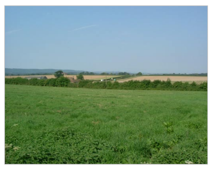
A simple, open arable landscape divided into large scale geometric fields bounded by hedgerow.