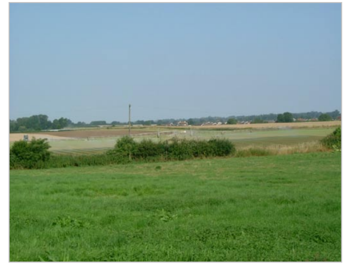
Hedgerows are low and gappy resulting in an open landscape with long views.