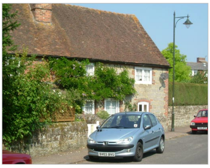
Building materials include sandstone, redbrick and clay tiles as seen here at Petworth.