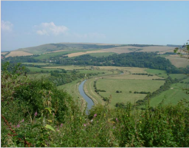
Panoramic views over the floodplain from the Seven Sisters Country Park.