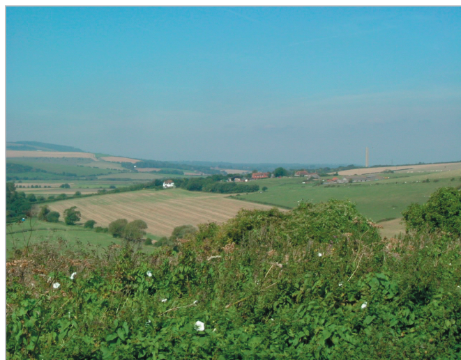
Hedgerow trees mark the field boundaries.