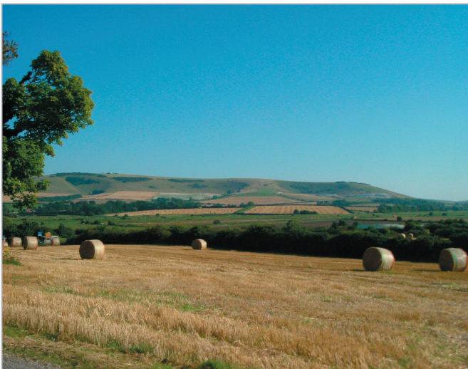
Arable land on the shallower slopes on the edge of the Glynde Reach.