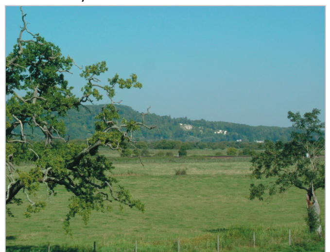
Disused chalk quarries are visually prominent on the valley sides.