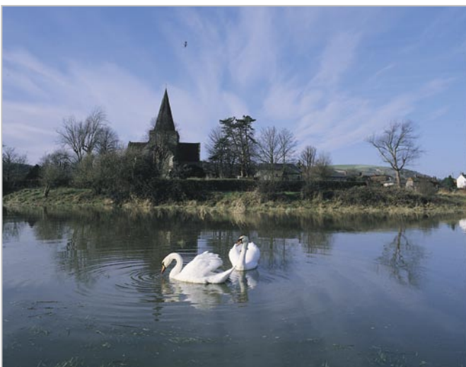
Alfriston is well placed on the river and developed into a small market town and trading settlement.