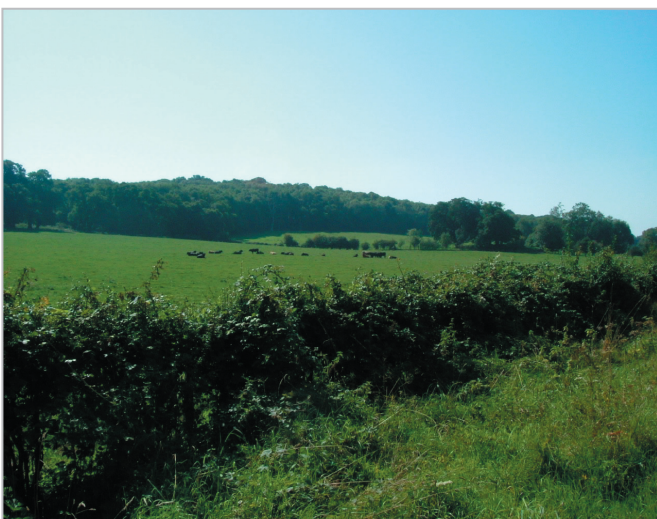
Valley sides incorporate both arable fields and pasture.