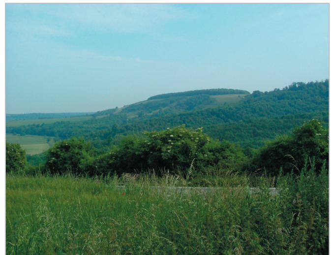
The woodlands are of particular biodiversity value, as exemplified by the large number of statutory and nonstatutory woodland sites.