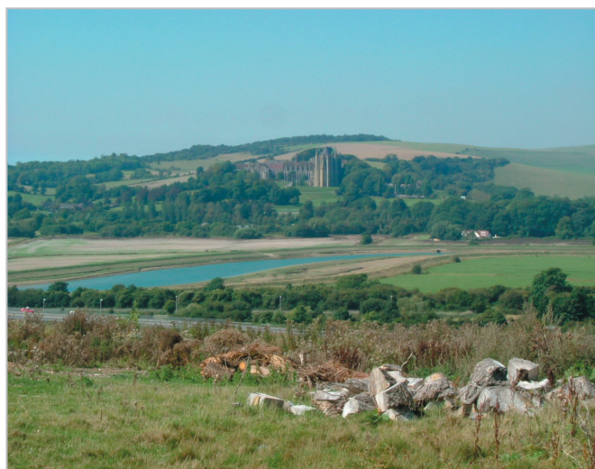
The gothic chapel of Lancing College is located at the southern end of the valley and forms a prominent landmark.