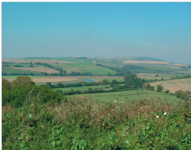
The less steep valley sides are cultivated and contain isolated farm buildings.