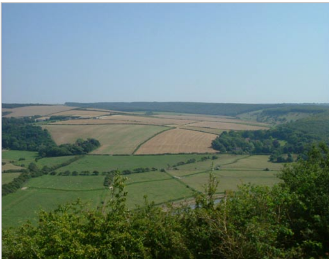
The sloping valley sides are dominated by a mixture of open, unimproved pasture, grassland and arable land.