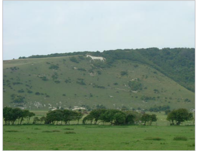
Distinctive steep chalk cliffs at 'High and Over' where a white horse is etched into the cliff edge.