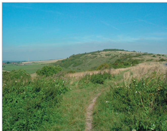
Scrub and chalk grassland characterises the steeper valley sides.