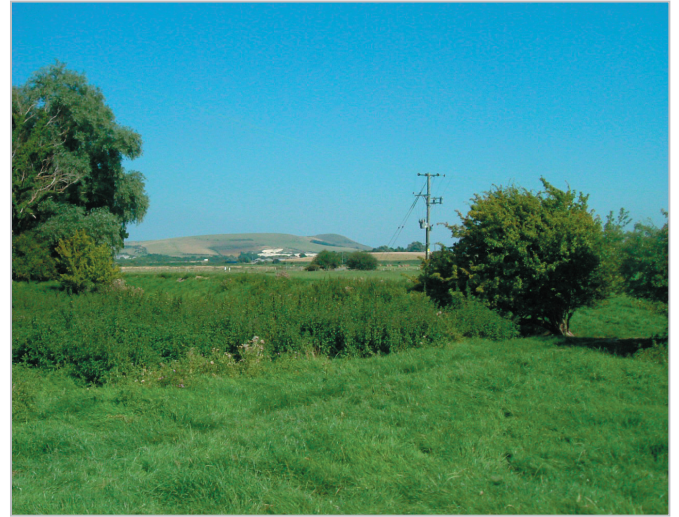
View across the Ouse floodplain to Southerham Pit on the eastern valley sides.