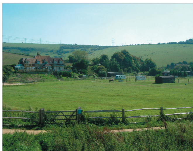
Pylons are a feature of the valley sides.