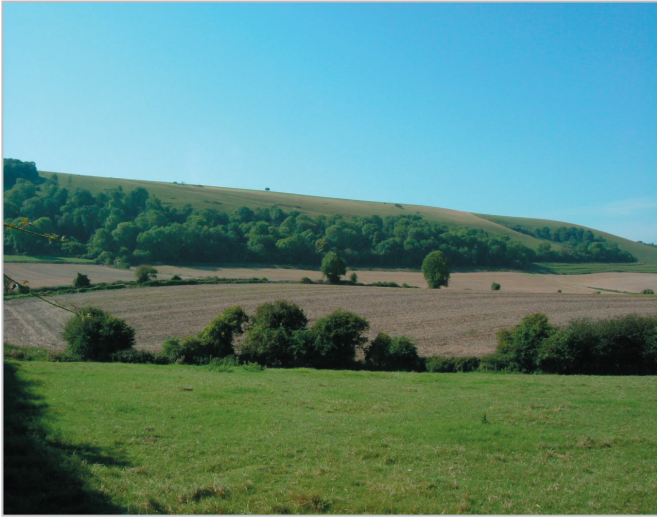
Valley sides carved from chalk are relatively steep and indented by a system of dry valleys.