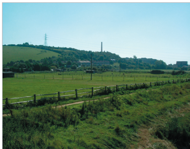
A large, disused cement works is prominent on the valley sides at Shoreham.