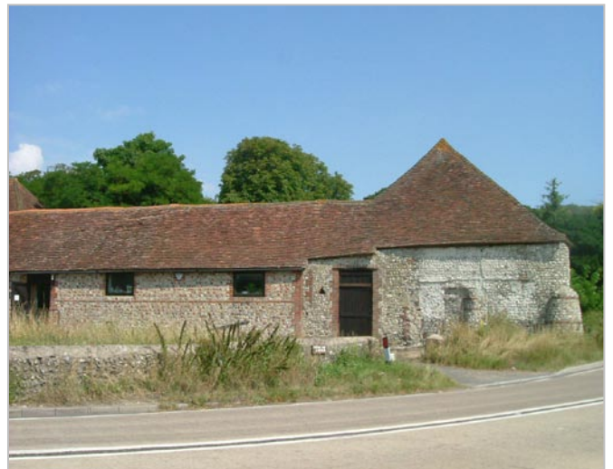
Typical building materials include flint, red brick, timber and clay tiles.