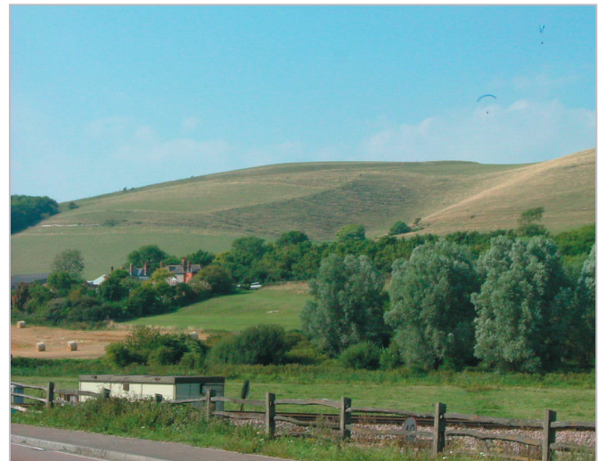
The steeply sloping edge of Mount Caburn forms the north eastern valley sides.