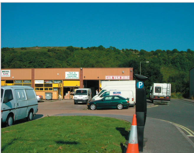
Wooded valley sides rise above the industrial estate on the floodplain.