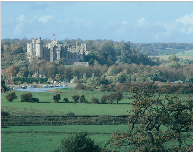
Arundel Castle stands at a commanding position at the southern end of the Arun Valley.