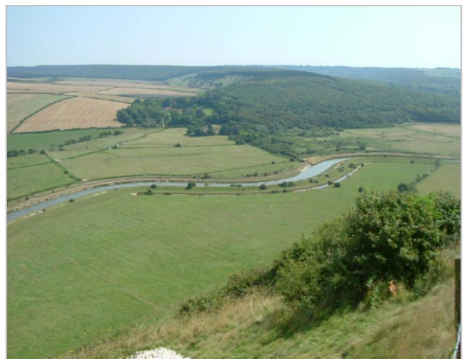
Hedgerows and trees are features of the lower valley sides and form a distinctive wooded edge to the floodplain.