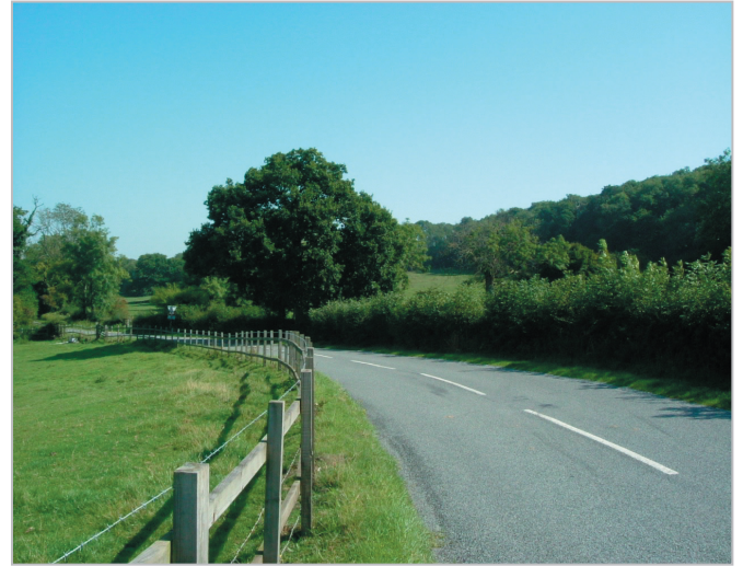
Woodland occupies steeper slopes as at Warning Camp.