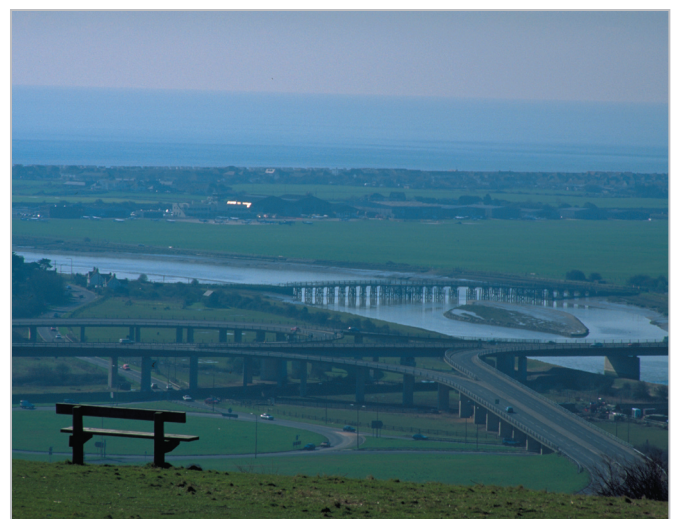
Infrastructure associated with the historic port of Lewes is a development on the valley sides.