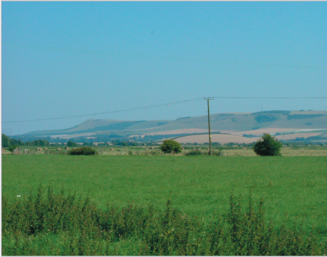
Away from the roads, the valley sides form a tranquil, rural setting to the floodplain.