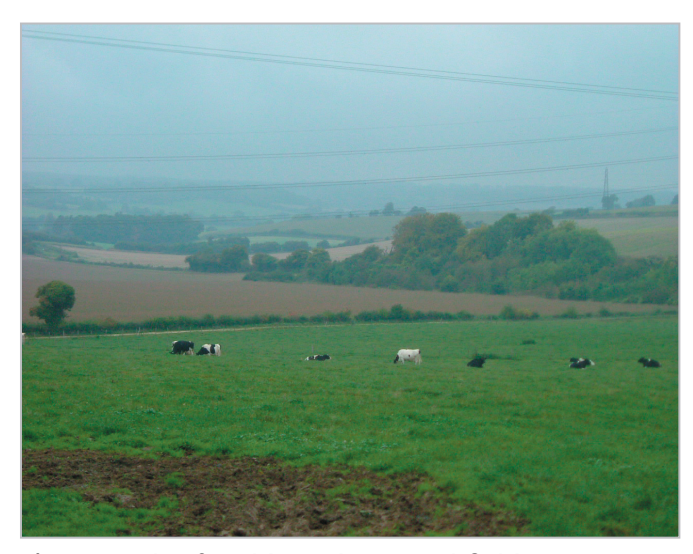
A network of arable and pastoral fields.