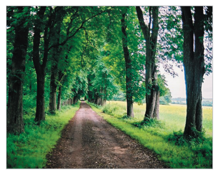
Lime Avenue, Longwood Estate.