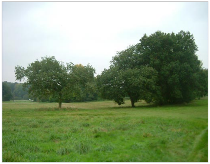
Woodland and unimproved grassland.