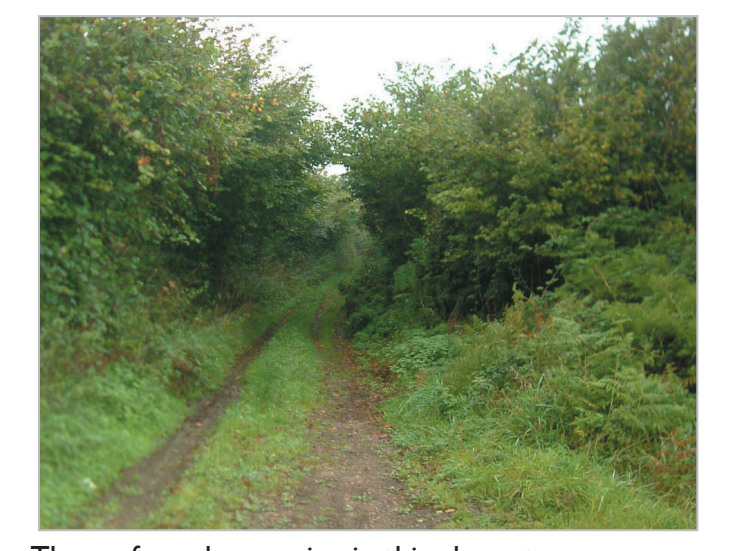
The surface clay capping in this character area results in a high proportion of tree and woodland cover which contributes to the enclosed character.