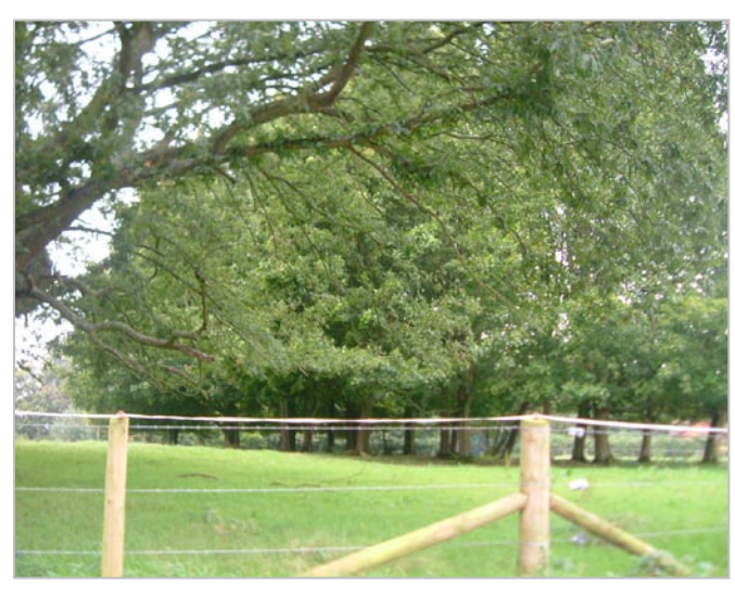
A number of minor parklands and designed landscapes.