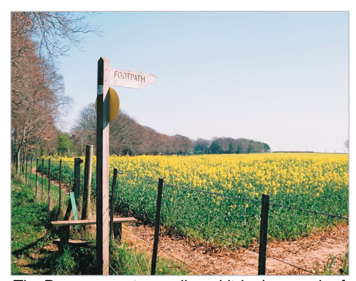
The Downs contain a well established network of public rights of way.