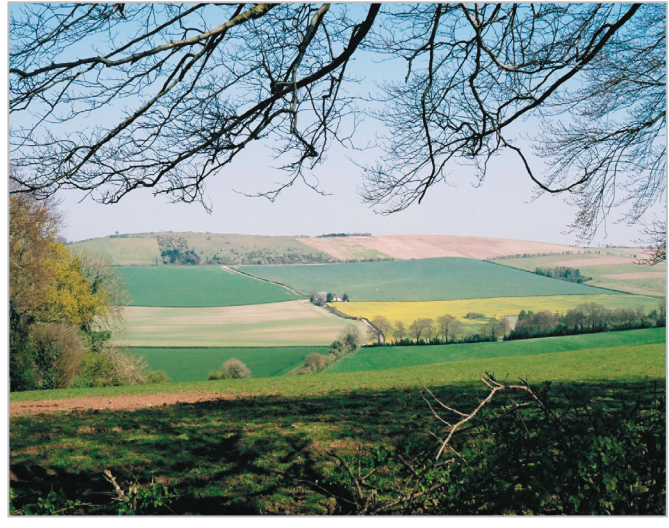
A prominent chalk ridgeline rises at Old Winchester Hill to form a prominent landmark.