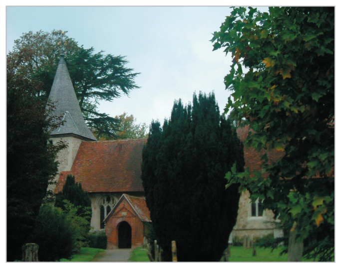
A distinctive church spire at Newton Valence.