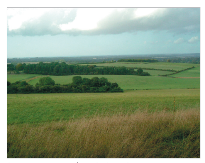
Long, open views from higher elevations.