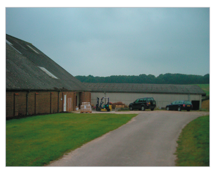
Modern farm buildings are prominent.