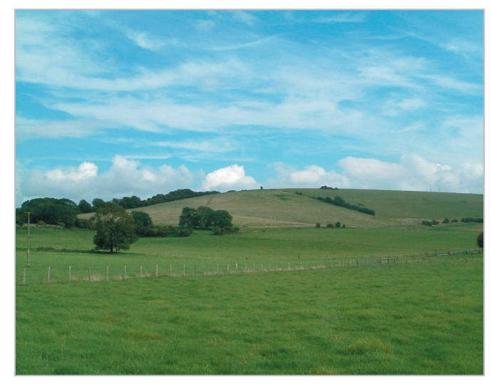
Blocks of unimproved grassland remain on steeper slopes.