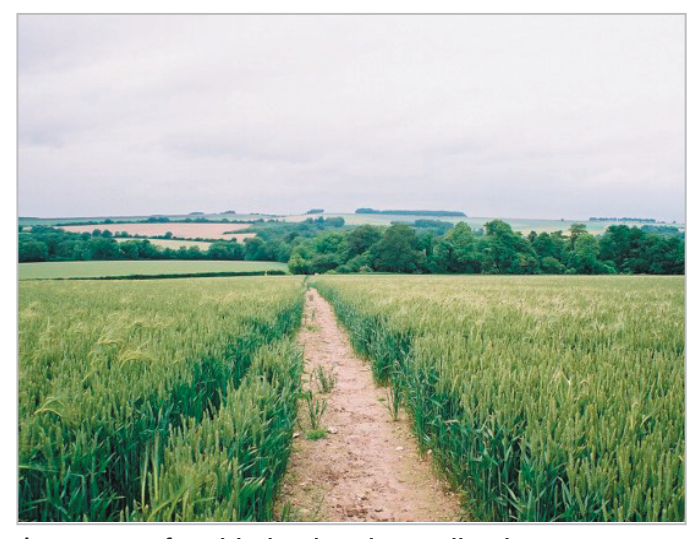
A mosaic of arable land and woodland.