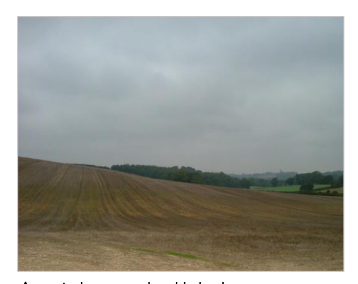
An actively managed arable landscape.