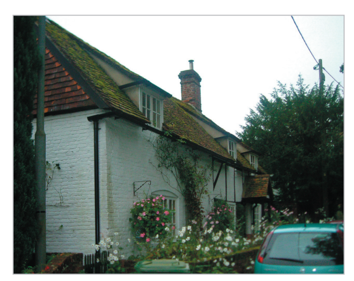
Housing at Farrington showing traditional building materials of brick and tiles.