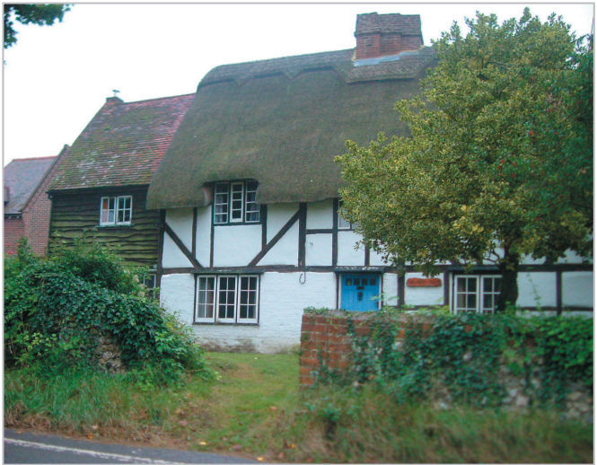
A low density of dispersed settlement with a scattering of nucleated settlements demonstrating traditional building techniques.