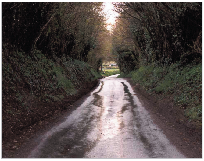
Ancient woodland borders a sunken lane at Inadown.