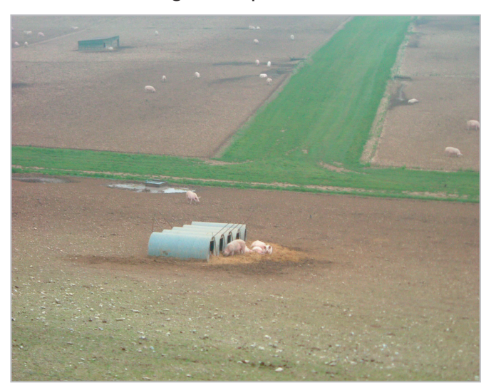
Pig farming is characteristic of some areas.