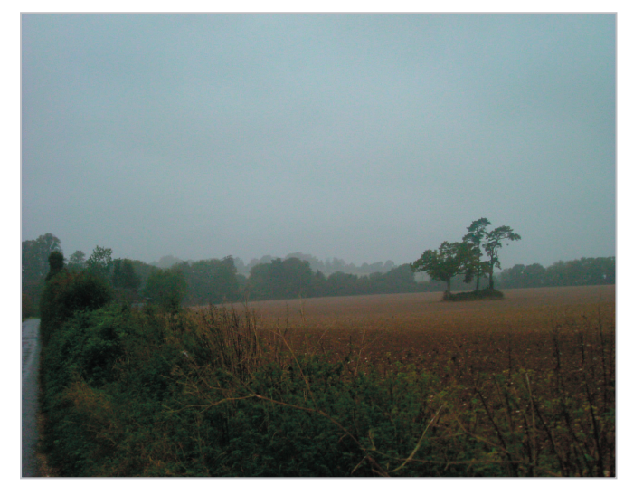
The well developed hedgerow network provides unity and bio-diversity value.