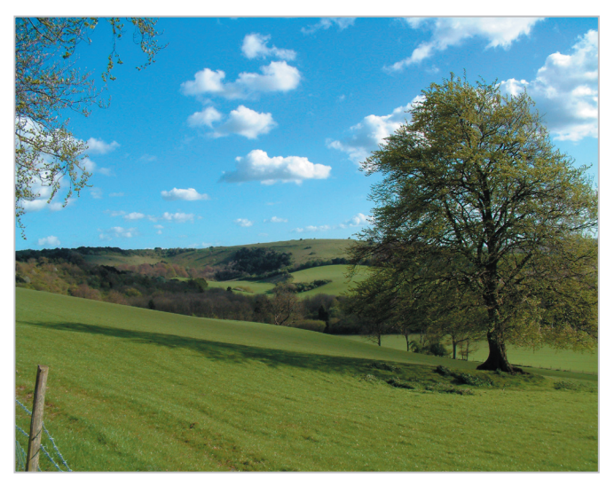
Large scale, rolling landform dissected by dry valleys.