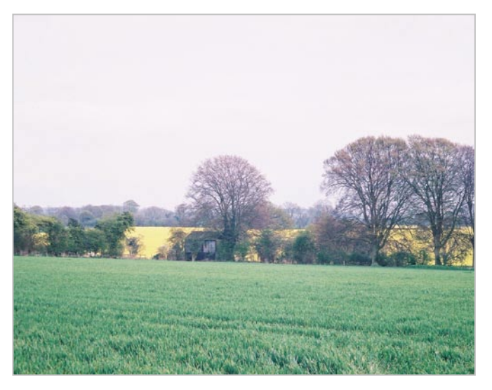
Village landscape, Bramdean.