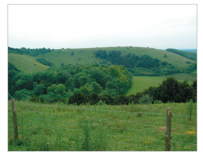
The secondary escarpment supports chalk grassland, assarts and hanging woodland.