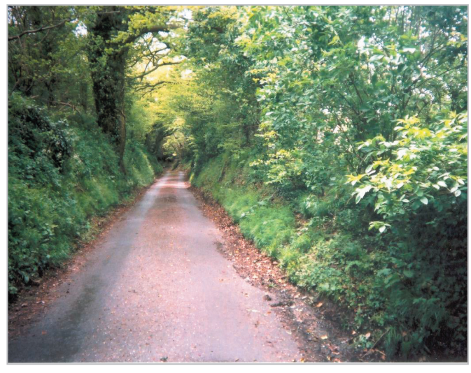
A network of rural lanes connects the characteristic scattered farmsteads and hamlets.