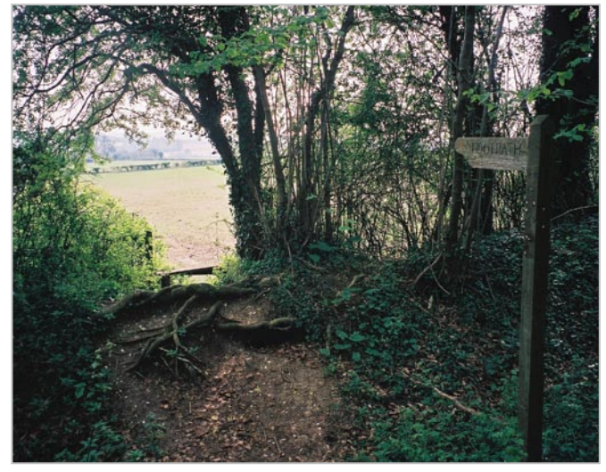
The area contains a well established network of public rights of way.