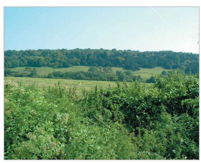
Woodland is interlocked with straight sided, irregular, arable fields linked by hedgerows.