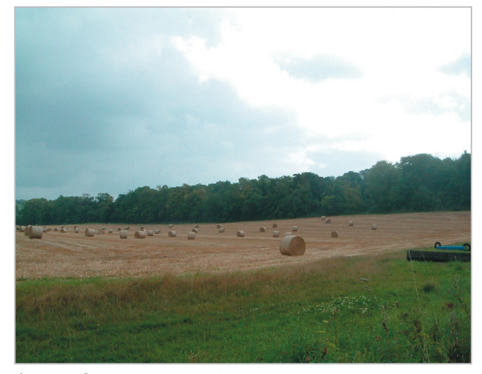
Arable fields bounded by woodland blocks.