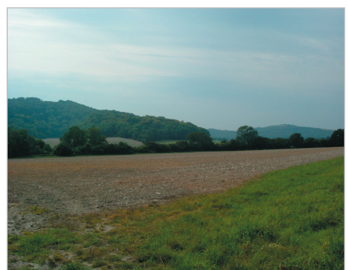
A deeply rural landscape with large areas devoid of roads and settlement.