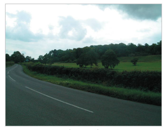
Estate parkland is a feature of the area.