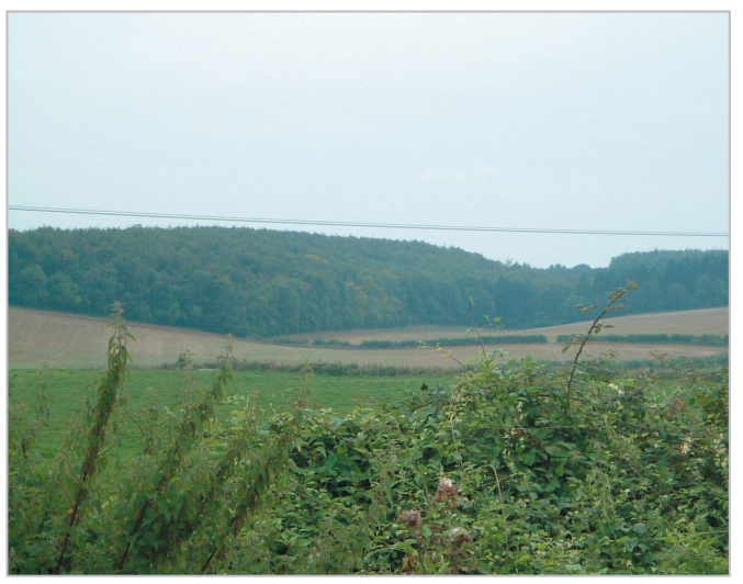
Large scale mosaic of commercial forestry and broadleaved woodland interlocked with straight-sided, irregular open arable fields linked by hedgerows.