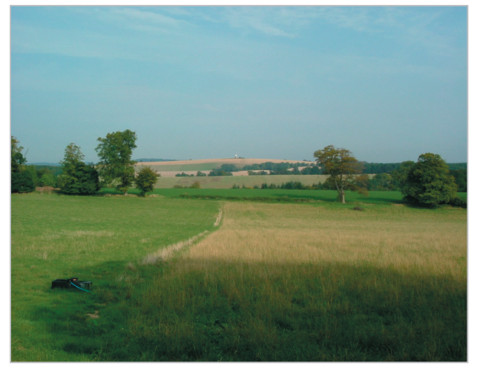
Areas of open pasture and arable land contrast with the more enclosed wooded areas.