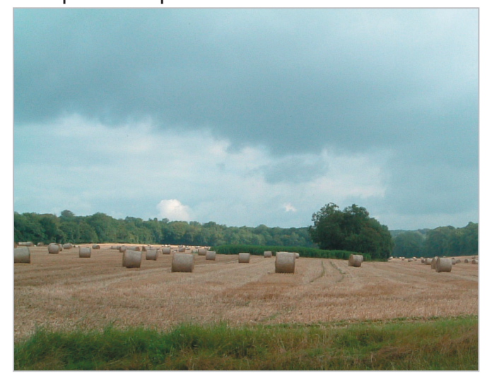
A working agricultural landscape of large, straight sided fields enclosed during the 18th and 19th century.