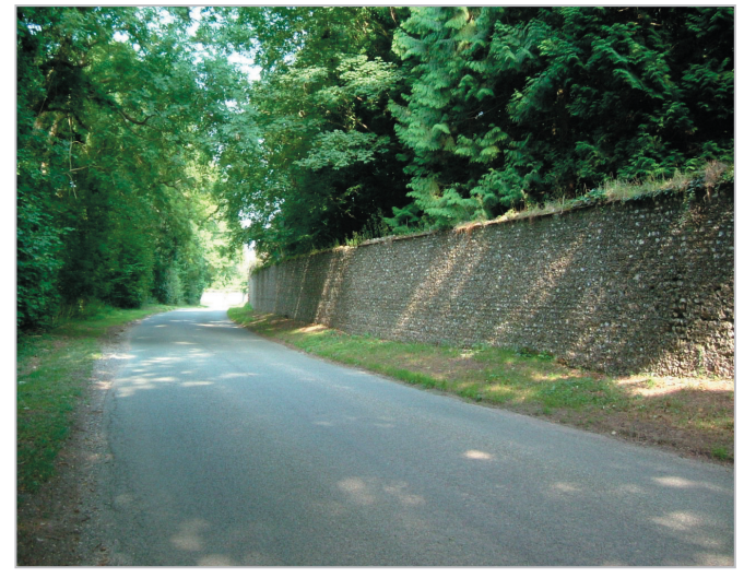
Features such as stone walls around estate parkland create an important visual focus.