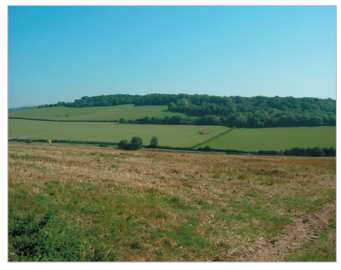
Woodland is interlocked with straight sided, irregular open arable fields linked by hedgerow.