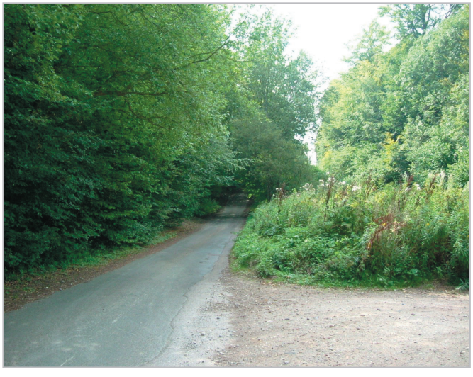
Quiet rural lanes are typical, with other areas inaccessible by road.