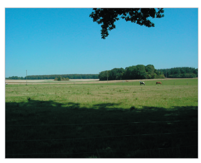
Areas of unimproved grassland used for pasture.