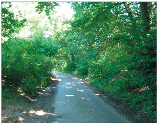
A deeply rural, secluded landscape with a sense of enclosure provided by wooded lanes.