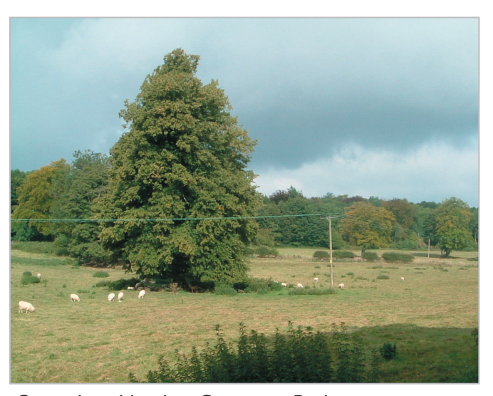
Grazed parkland at Compton Park.