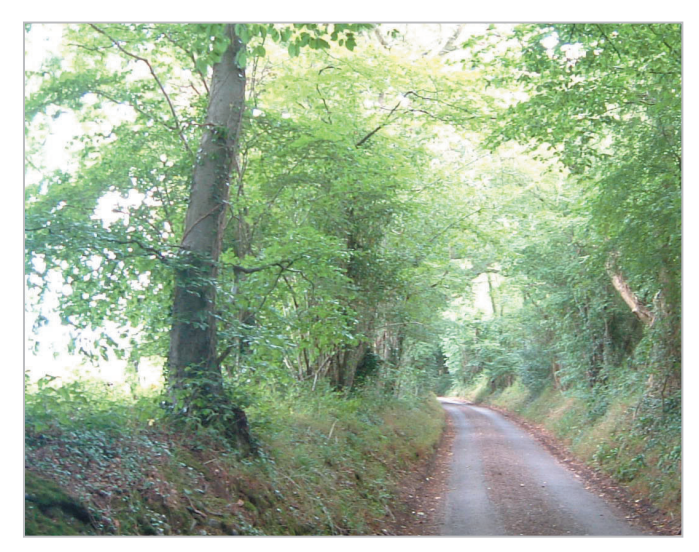
A network of minor hedged lanes, bridleways and public rights of way, provide access through the tranquil landscape.