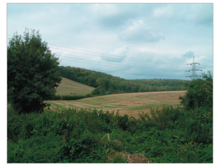
Views to woodland at Queen Elizabeth Park.