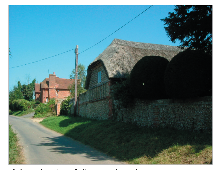
A low density of dispersed settlement, characterised by traditional building materials of brick, flint and hatch.