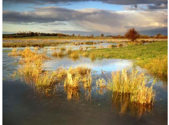
Amberley Wildbrooks, West Sussex

The South Downs National Park is in South East England, one of the most crowded parts of the United Kingdom. Although its most popular locations are heavily visited, many people greatly value the sense of tranquillity and unspoilt places which give them a feeling of peace and space. In some areas the landscape seems to possess a timeless quality, largely lacking intrusive development and retaining areas of dark night skies. This is a place where people seek to escape from the hustle and bustle in this busy part of England, to relax, unwind and re-charge their batteries.